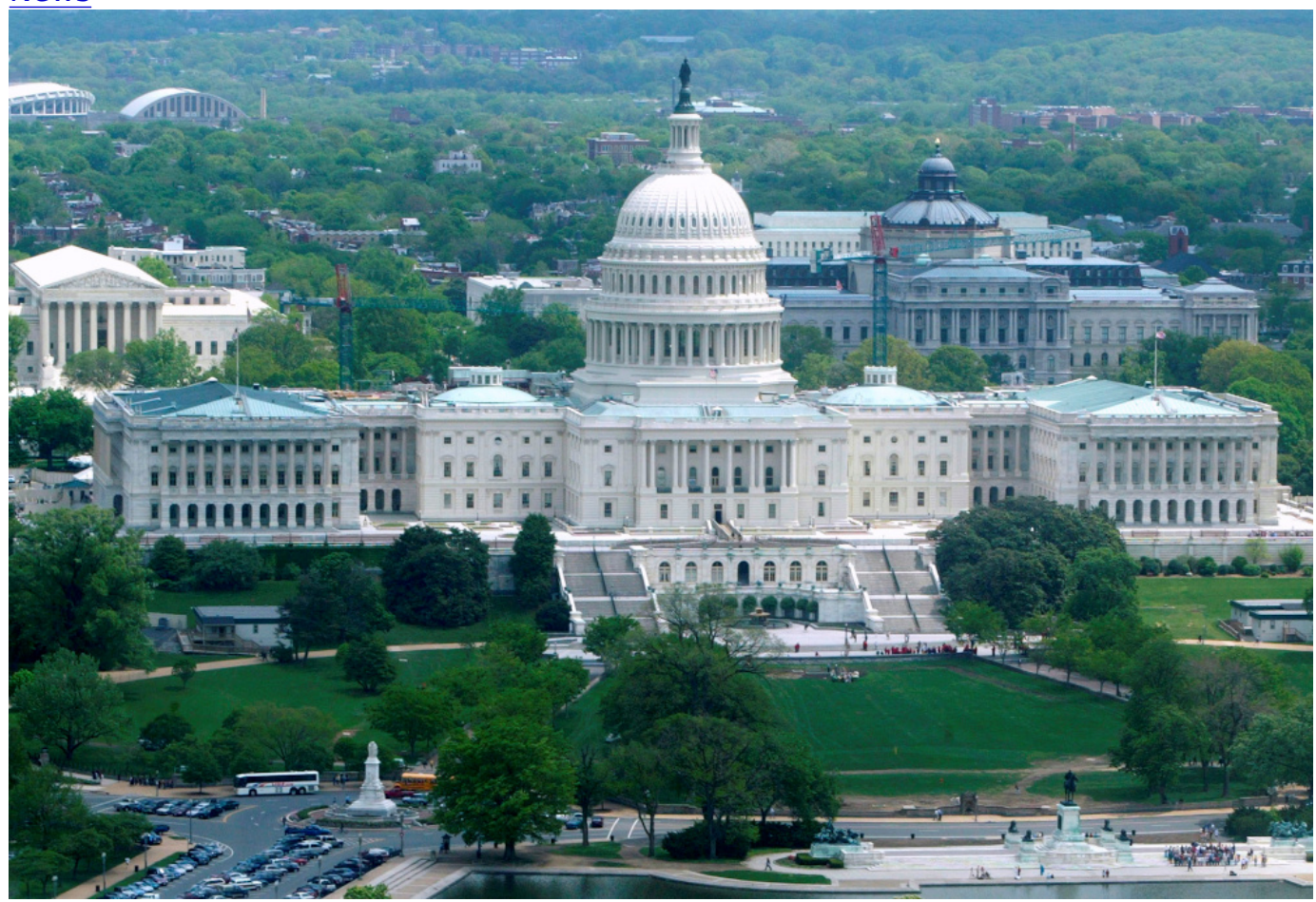
The U.S. Capitol is seen in this 2004 file photo. In a late vote May 27, 2020, the U.S. House overwhelmingly passed a measure condemning the Chinese Communist Party for forcing Uighurs, ethnic Kazakhs and other Muslim minorities into indoctrination camps in the country's Xinjiang region.