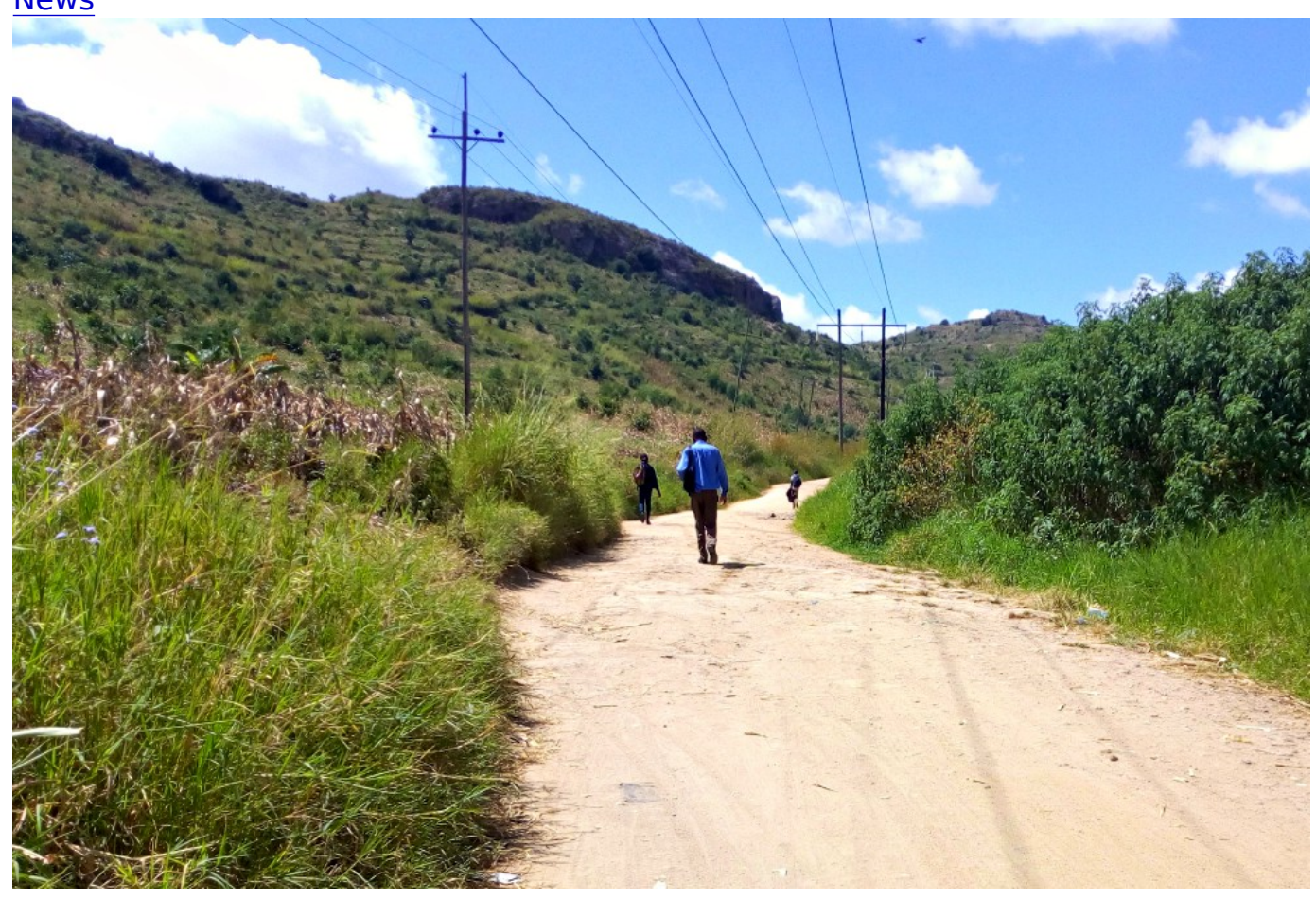
People walk along a road in Malawi April 13.