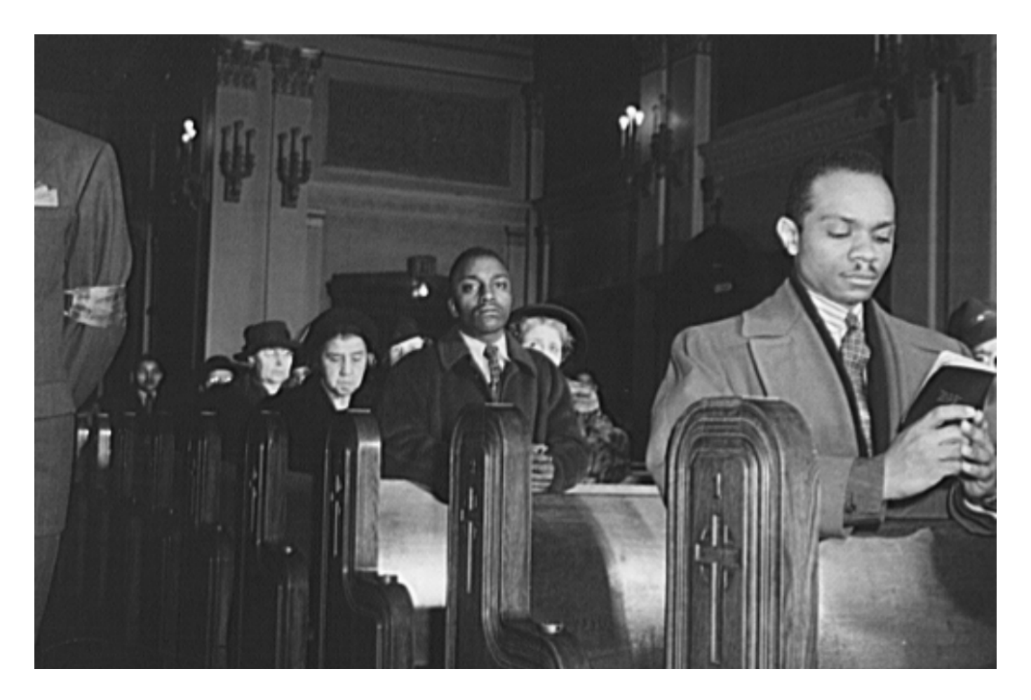
Sunday Mass at Corpus Christi Church, a predominantly black parish, in Chicago in 1942

The systematic denial and erasure of Black Catholic history denies the fundamental truth that Black history is Catholic history. It also a part of the system of white supremacy that continues to inflict harm on the descendants of the enslaved people who literally built this country and the American church and those who continue to benefit from the brutal history of colonialism, slavery and segregation.