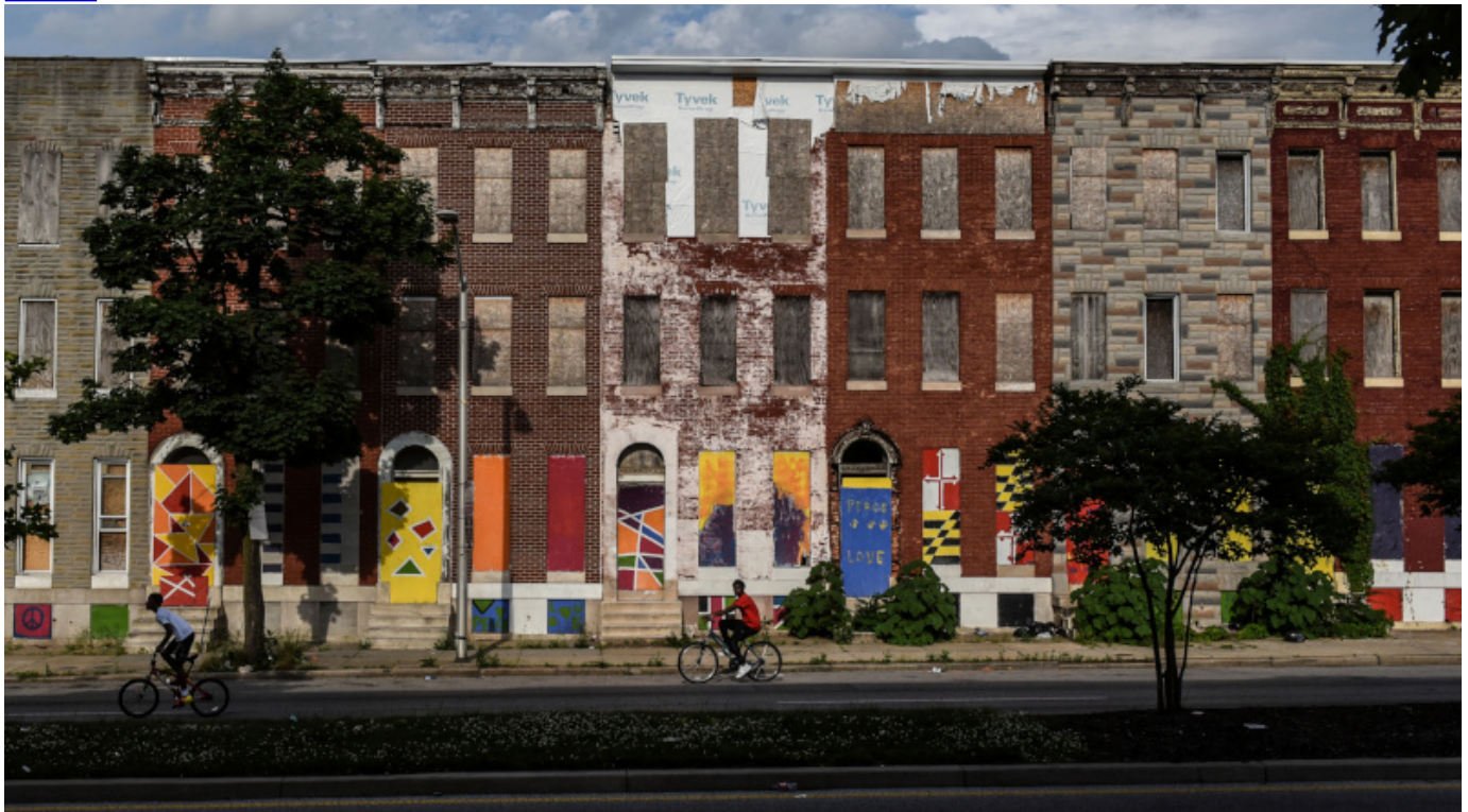
Boys ride their bikes past boarded-up and abandoned rowhouses in Baltimore in May 2019.