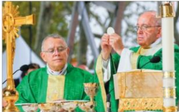
Pope Francis, right, receives the Eucharist as he celebrates the closing Mass of the World Meeting of Families in Philadelphia in 2015. With him at the altar is Philadelphia Archbishop Charles Chaput.