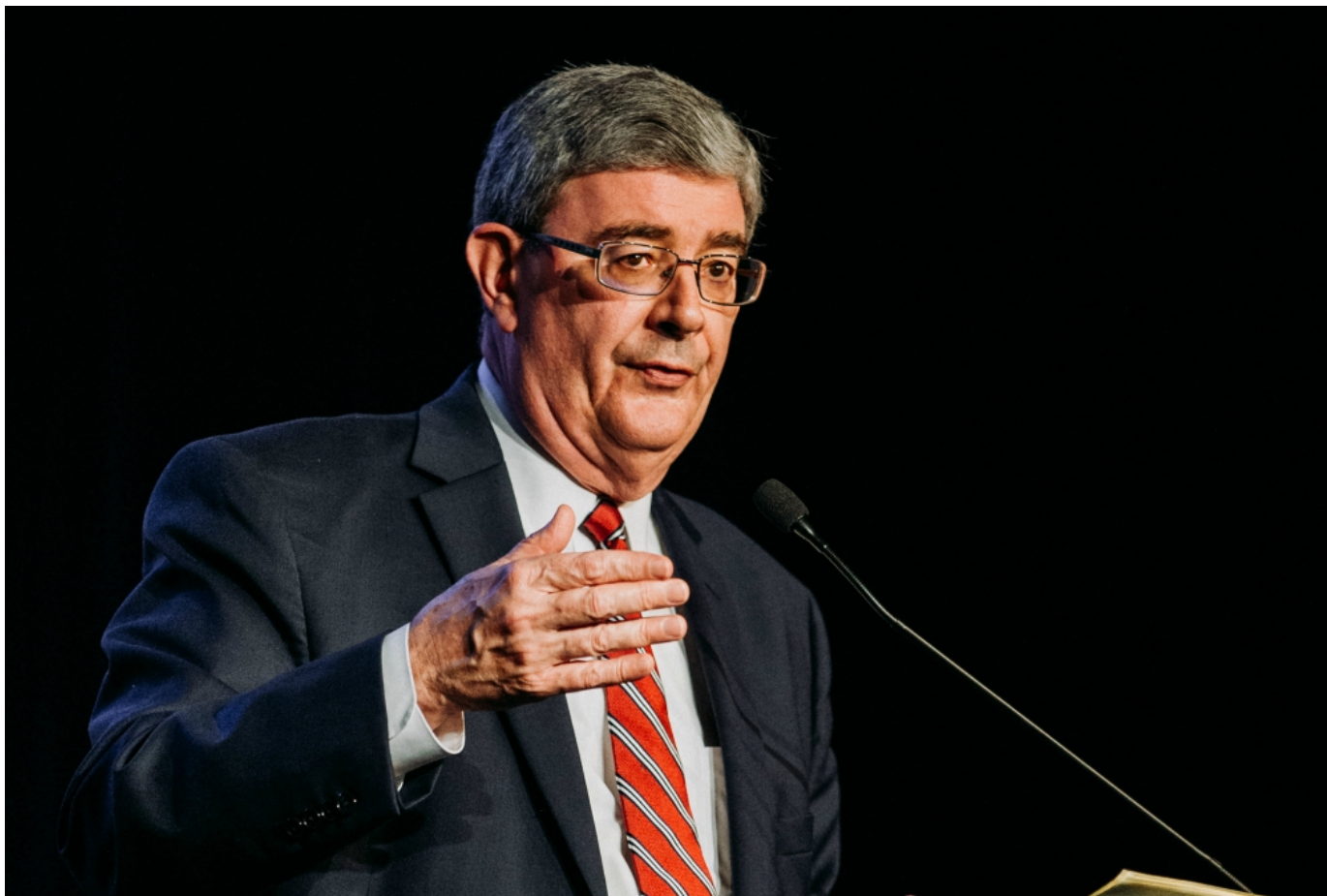
George Weigel speaks July 25, 2019, at the Napa Institute's annual Summer Conference in California.