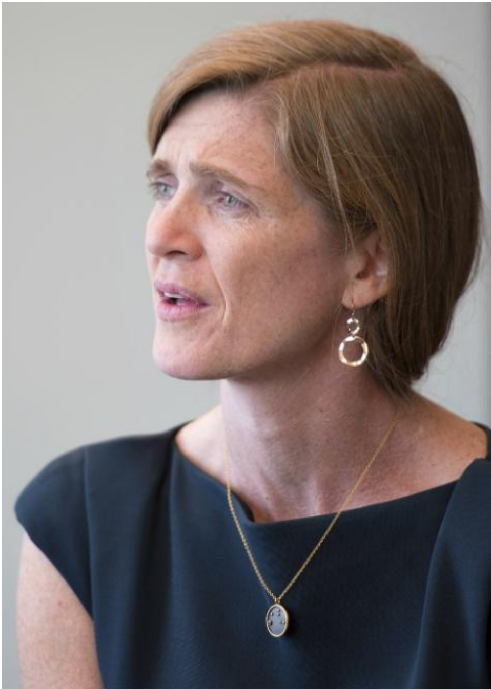
Samantha Power at the United Nations in June 2016

Before Power and others in the White House flew to Oslo with the president for the Nobel ceremony and acceptance speech, she was in the Oval Office to share her feelings in a lengthy memo on "warfare and morality" and notions that came to her when she recalled the writings of Reinhold Niebuhr, a theologian and champion of