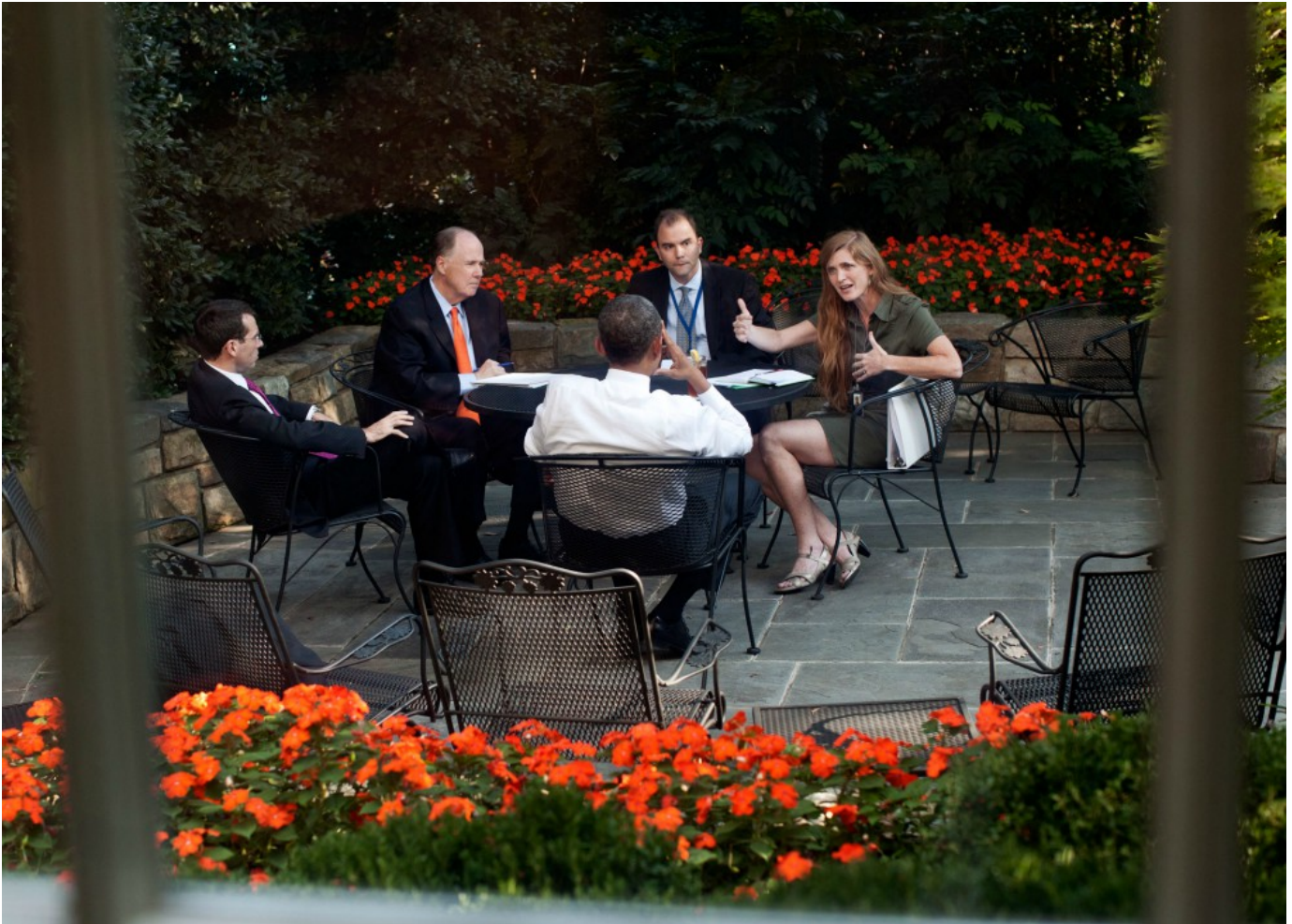
President Barack Obama meets with advisers, including Samantha Power (right), on the patio outside the Oval Office, Sept. 14, 2011.