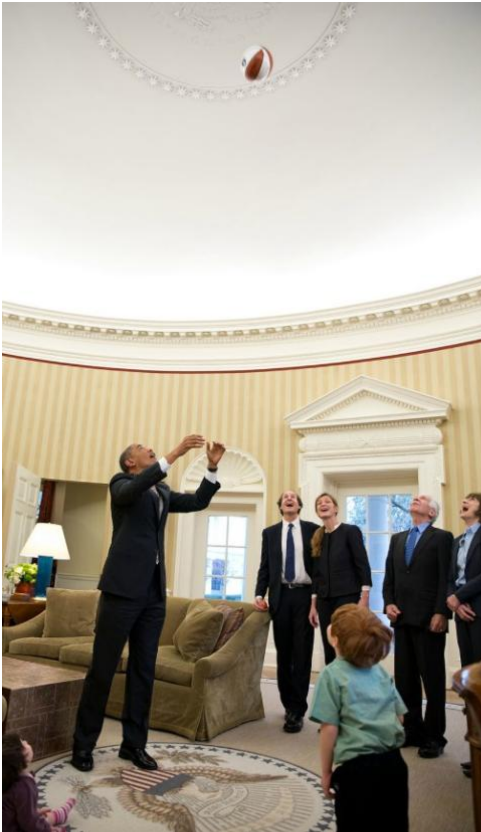
In February 2013, President Barack Obama throws a basketball to show Samantha Power and Cass Sunstein's children how high the Oval Office ceiling is.