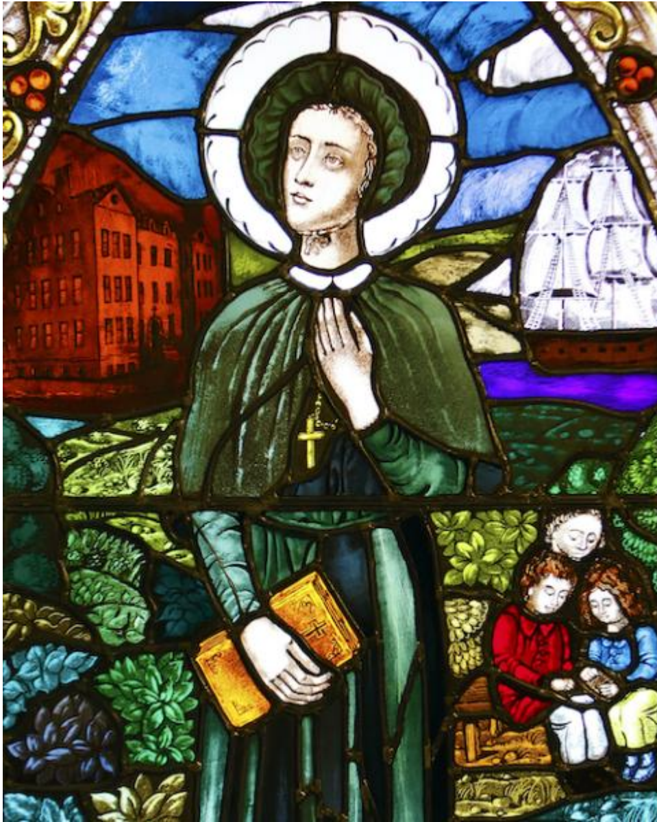
St. Elizabeth Ann Seton is depicted in a stained-glass window at the Basilica of St. Patrick's Old Cathedral in New York City.