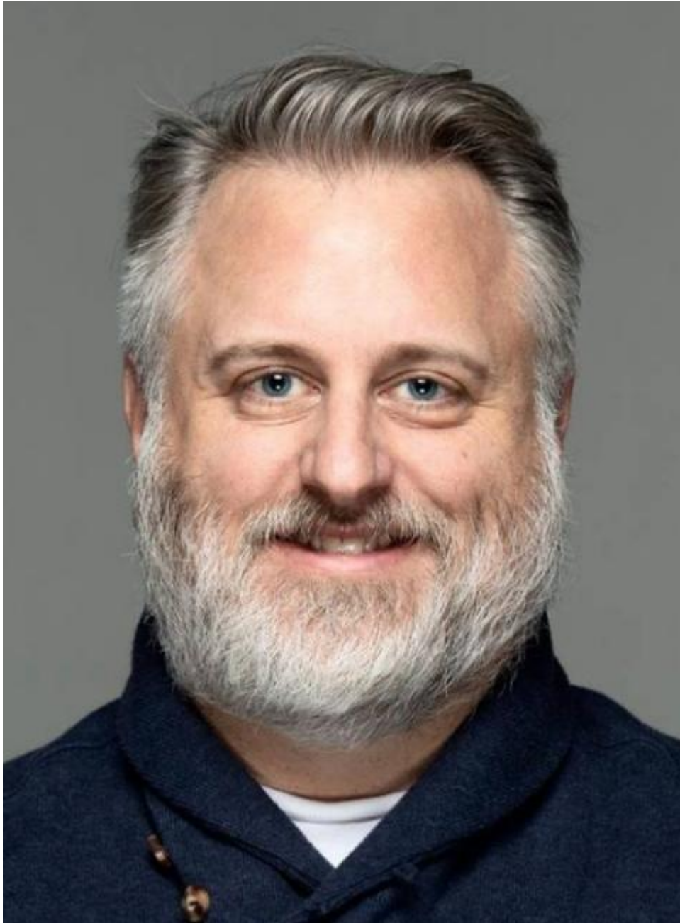
Hank Stuever (The Washington Post)