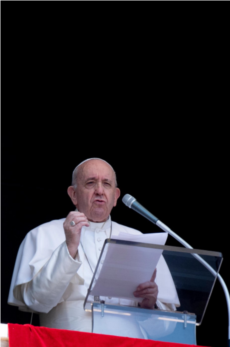
Pope Francis speaks as he leads the Angelus from the window of his studio overlooking St. Peter's Square at the Vatican Aug. 9, 2020. The pope said calling out to God for help is key during periods of doubt and fear.