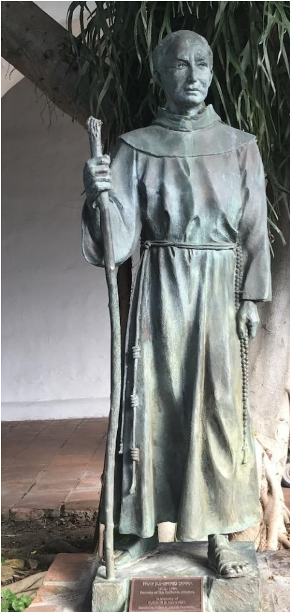
FRAY JACINTO SERRA 1713-1789 Parish of San Felipe, Monterey in memory of F. J. SERRA, B. L. S. J. O. S. A. SANTA MONICA, CALIFORNIA, 1961