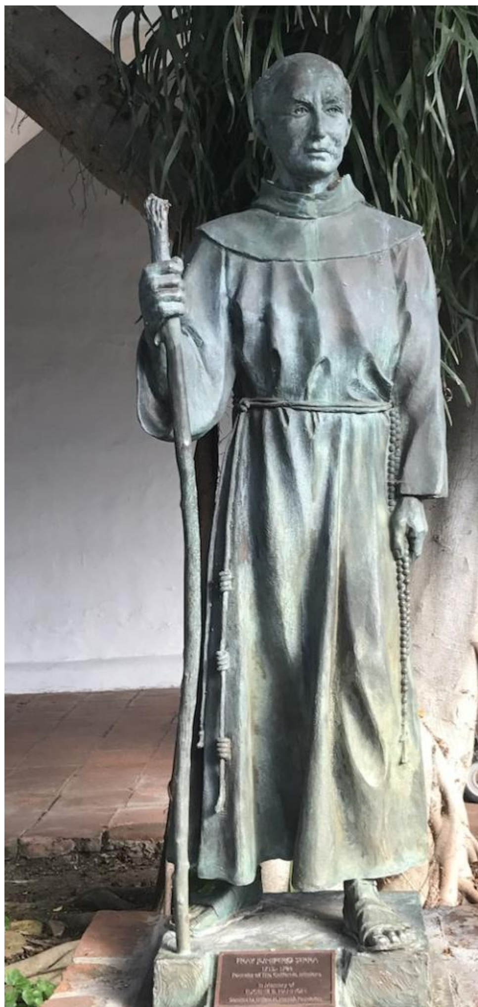
FRAY JACINTO SERRA 1713-1789 Franciscan friar, missionary in the history of California and the United States San Diego, California, August 15, 1980