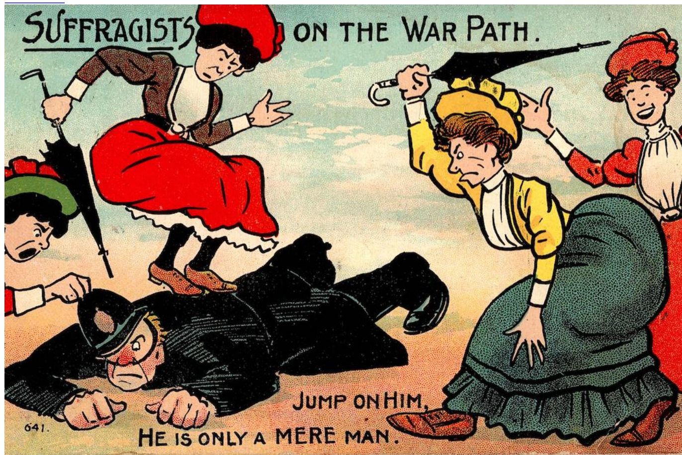
Anti-suffrage postcard