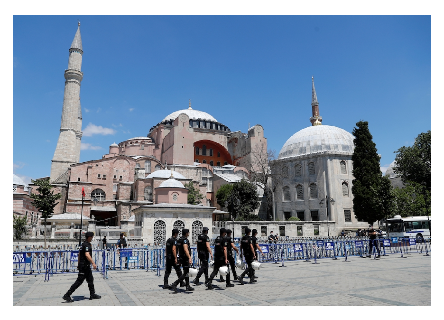
Turkish police officers walk in front of Hagia Sophia July 11 in Istanbul.

The virtue of leaving Hagia Sophia as a museum is that it allows people to feel that complex mix of emotions — pride and sadness, appreciation and shame — that the space evokes. The Byzantine mosaics and Islamic calligraphy speak to the value of both religions and the ethnic groups that adhered to each, as well as the injustices that have been perpetrated throughout the centuries — not only Muslim against Christian, but also Christian against Muslim and Christian against Christian (our tour guided pointed to a red mark on the wall, claiming that it was the bloody handprint of a Catholic in the Fourth Crusade).