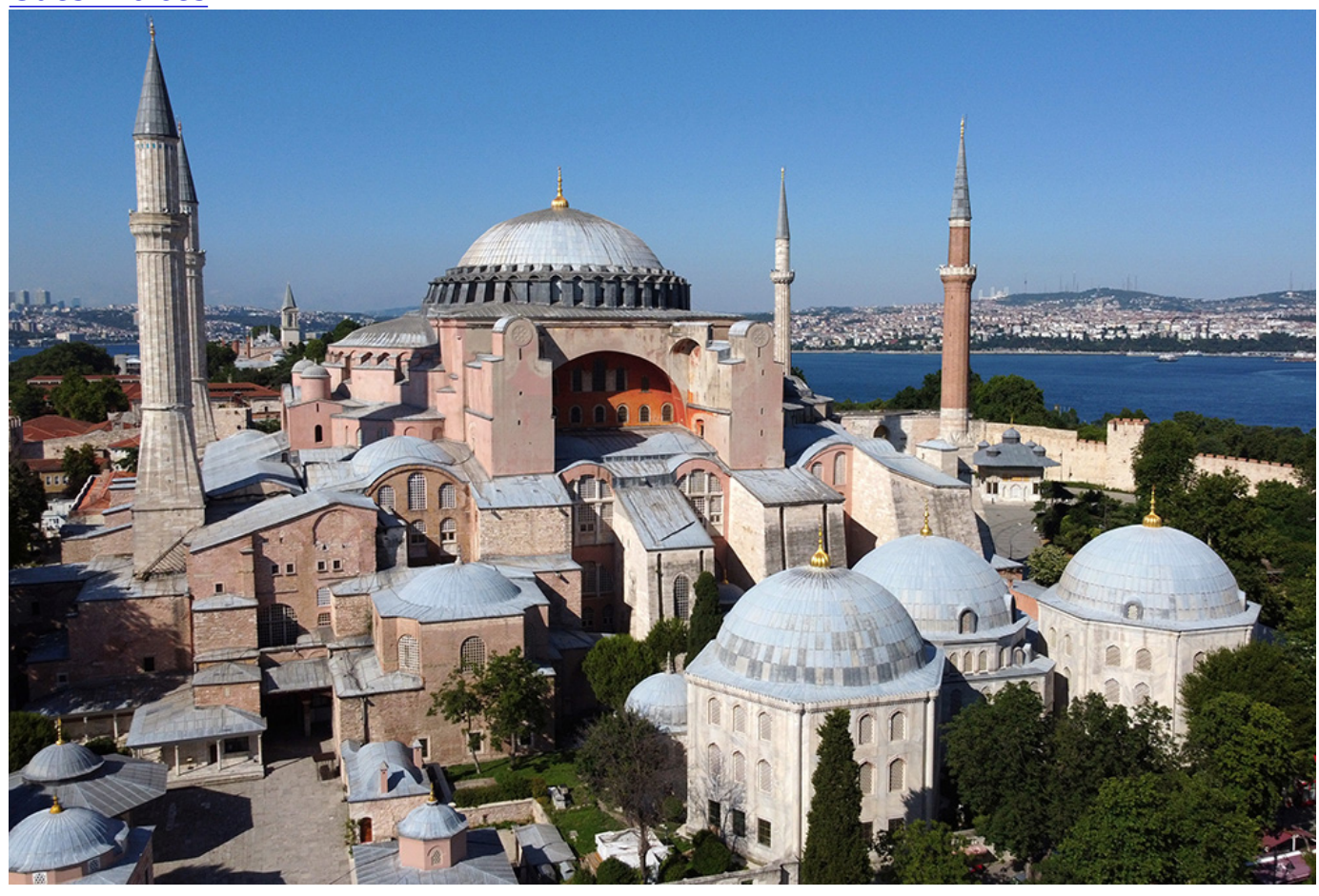
Hagia Sophia is seen June 30 in Istanbul.