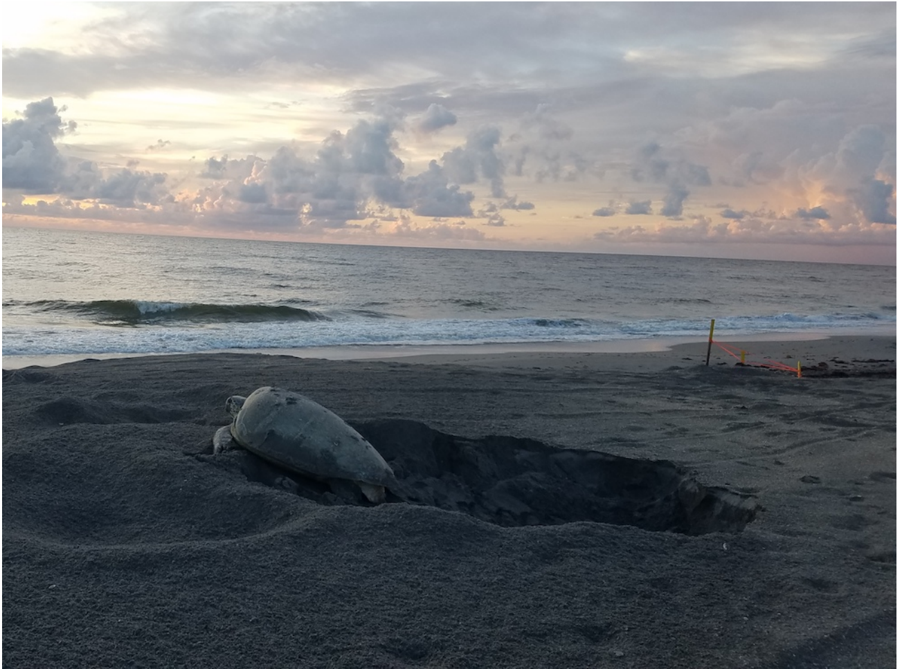
A green sea turtle, " Chelonia mydas ," heads back to the water after nesting, June 14, 2020.

A sea turtle nest is marked by orange tape to protect it from beachgoers. Helped by conservation measures, monitoring and research, sea turtles are still nesting along Florida beaches despite development pressures.