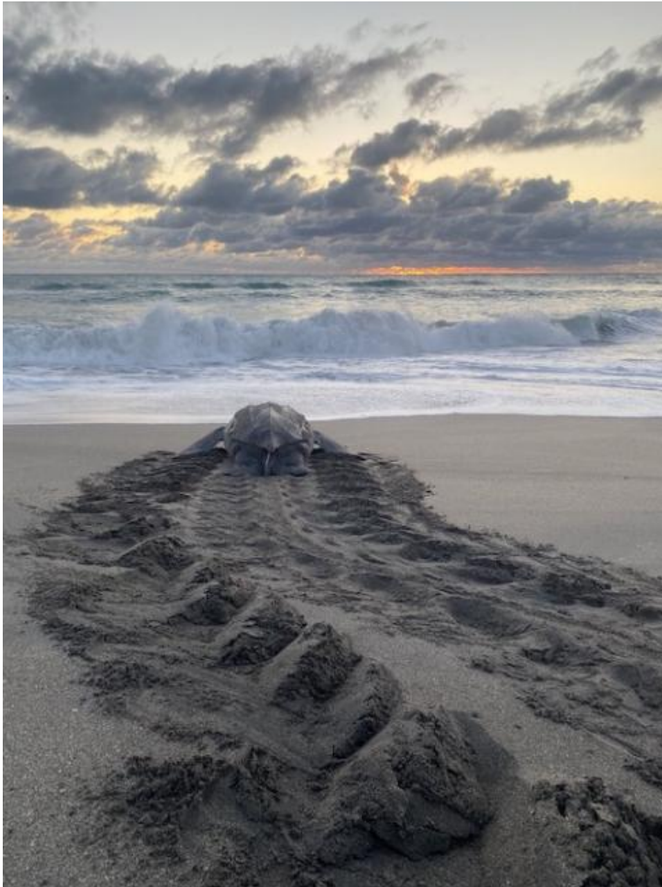
A leatherback sea turtle, " Dermochelys coriacea ," returns to the water after nesting, May 7, 2014

clutch of eggs. They would carefully check the nest and erect the orange plastic tape "fence" around it with stakes bearing a code for each species — not to be revealed lest poachers figure it out — and signs warning against disturbing the nests. Penalties under Florida law can include 60 days in jail and a $500 fine, plus an additional $100 for each egg destroyed or taken. The federal Endangered Species Act allows sanctions of up to a year in prison, civil fines of $25,000 or criminal penalties of $100,000.