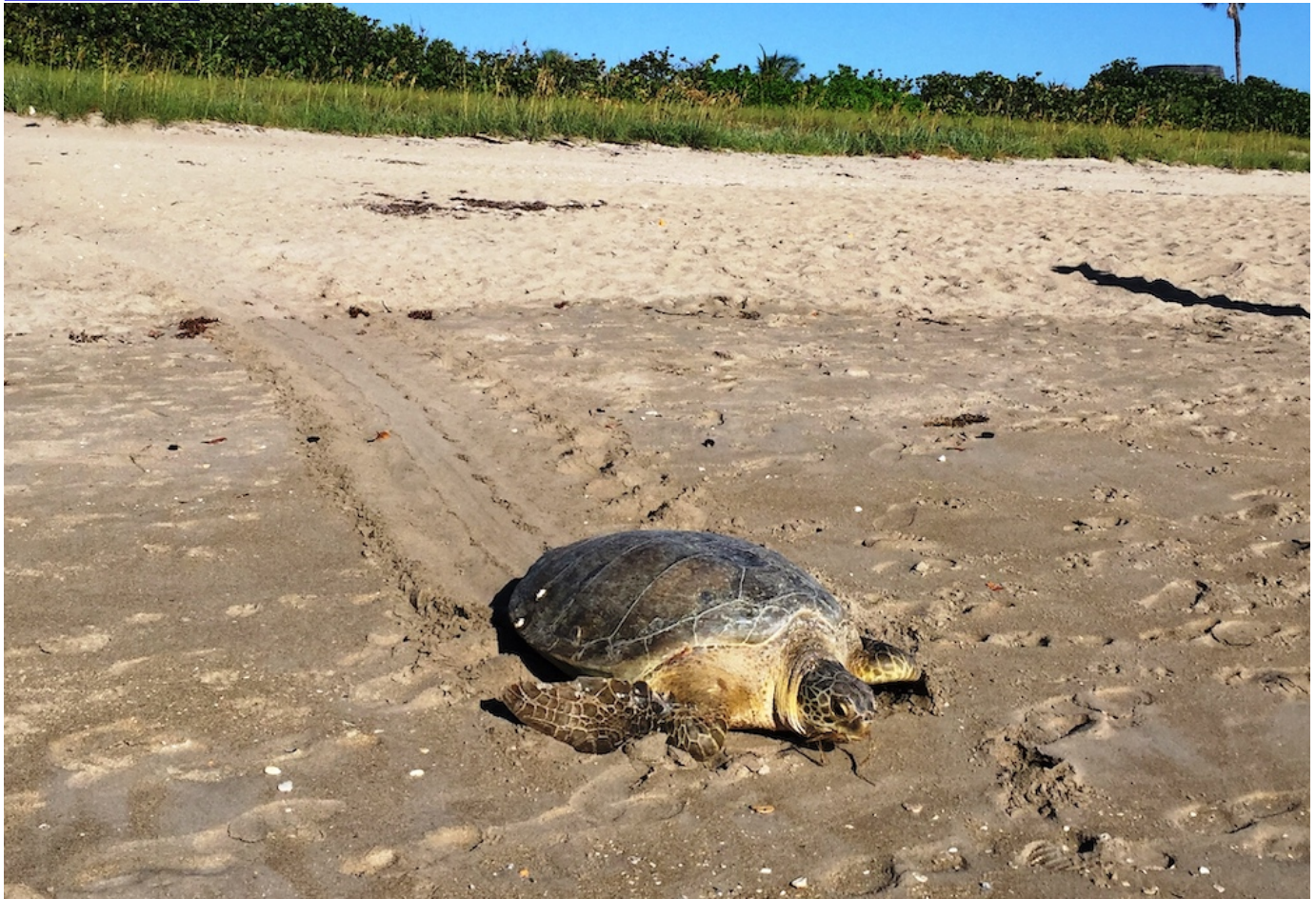
A green sea turtle, " Chelonia mydas ," returns to the water after laying a nest, July 4, 2017.