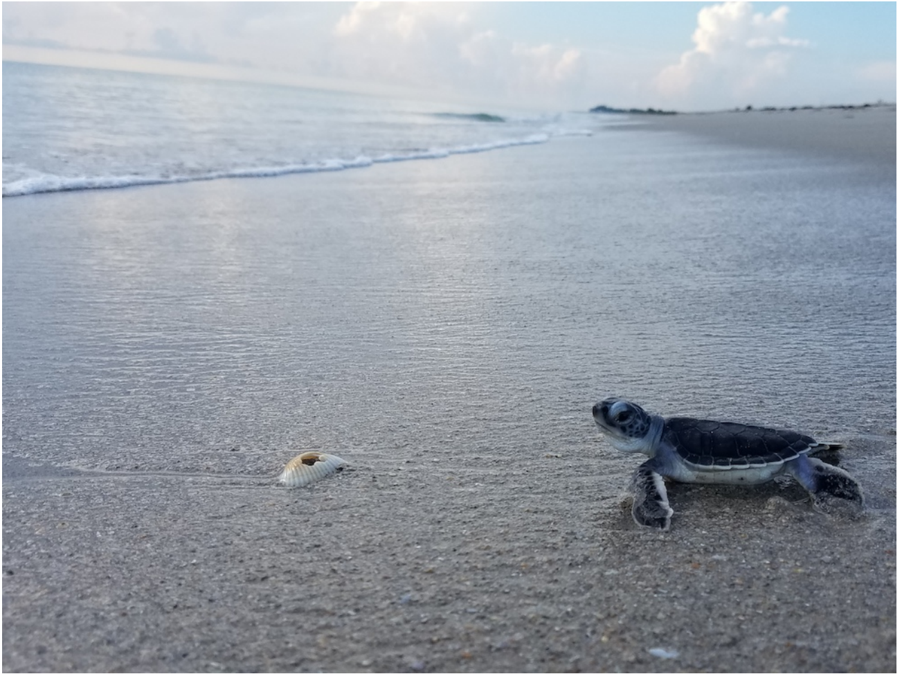
A green sea turtle hatchling, " Chelonia mydas ," Aug. 30, 2020 (Ecological Associates Inc.)