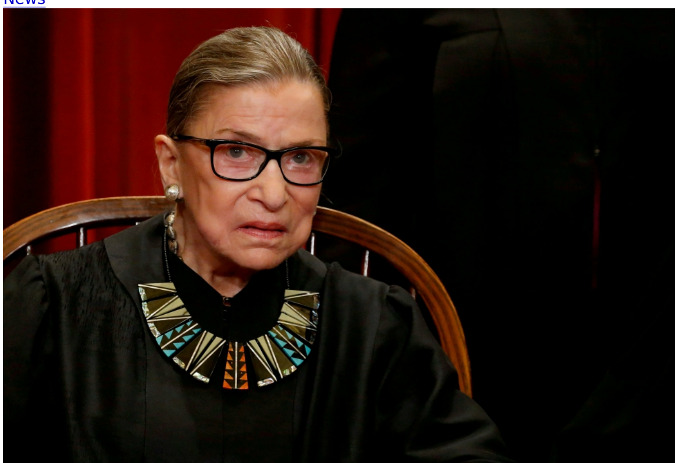
U.S. Supreme Court Justice Ruth Bader Ginsburg in 2017. Ginsburg died Sept. 18 due to complications of metastatic pancreas cancer. She was 87.