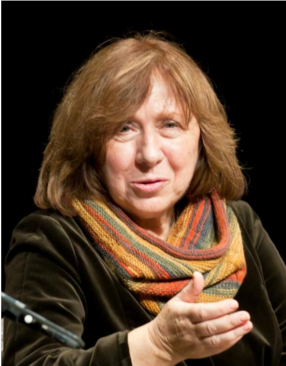
Svetlana Alexievich in 2013

The focus on the Soviet Union is more than sufficient as a subject, of course, and it fits in perfectly with Alexievich's larger project of focusing on Russian and Soviet history — "polyphonic writings, a monument to suffering and courage in our time," as the Nobel committee in 2015 so aptly put it.