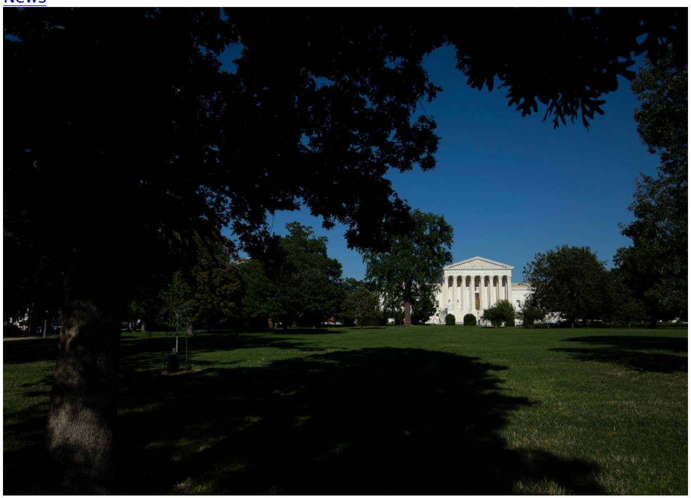
The U.S. Supreme Court is seen in Washington in this 2018 file photo.