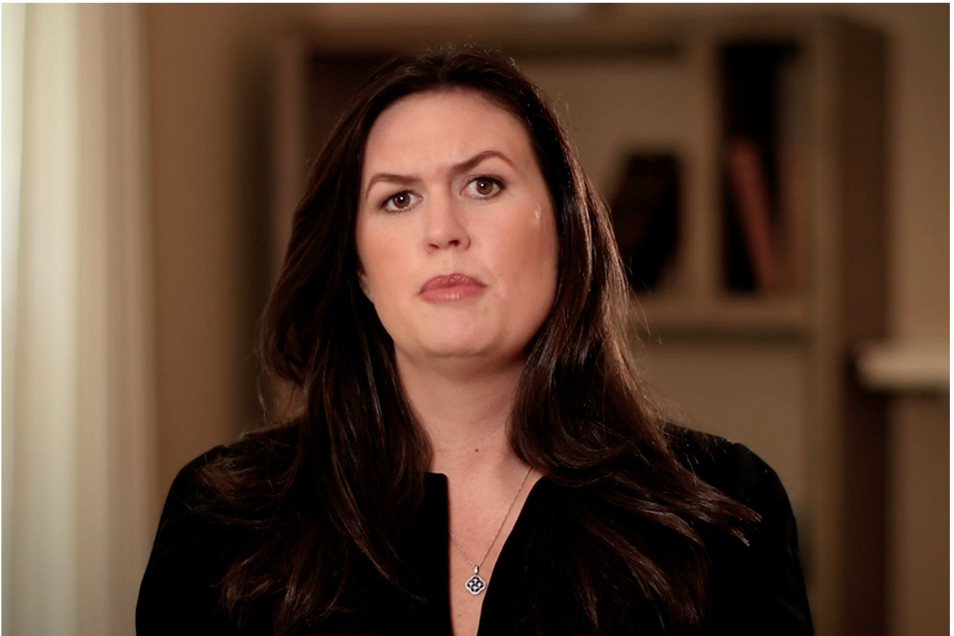
Sarah Huckabee Sanders gives a keynote address during the "We Are Not Giving Up On Life" virtual fundraising event for Right to Life of Michigan

The event was co-sponsored by the Michigan Knights of Columbus, a state chapter of the Catholic fraternal organization, and included a keynote address from former White House press secretary Sarah Huckabee Sanders who served in the Trump administration from 2017-2019.