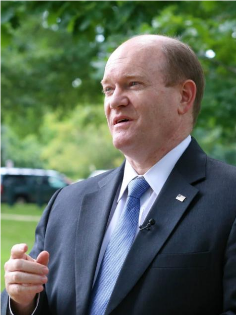
Sen. Chris Coons

Coons added that the faith community "can lift up the urgency" of the long-term consequences of climate change, "which is imminent and present in the experiences of so many around the world here in the short term, as well."