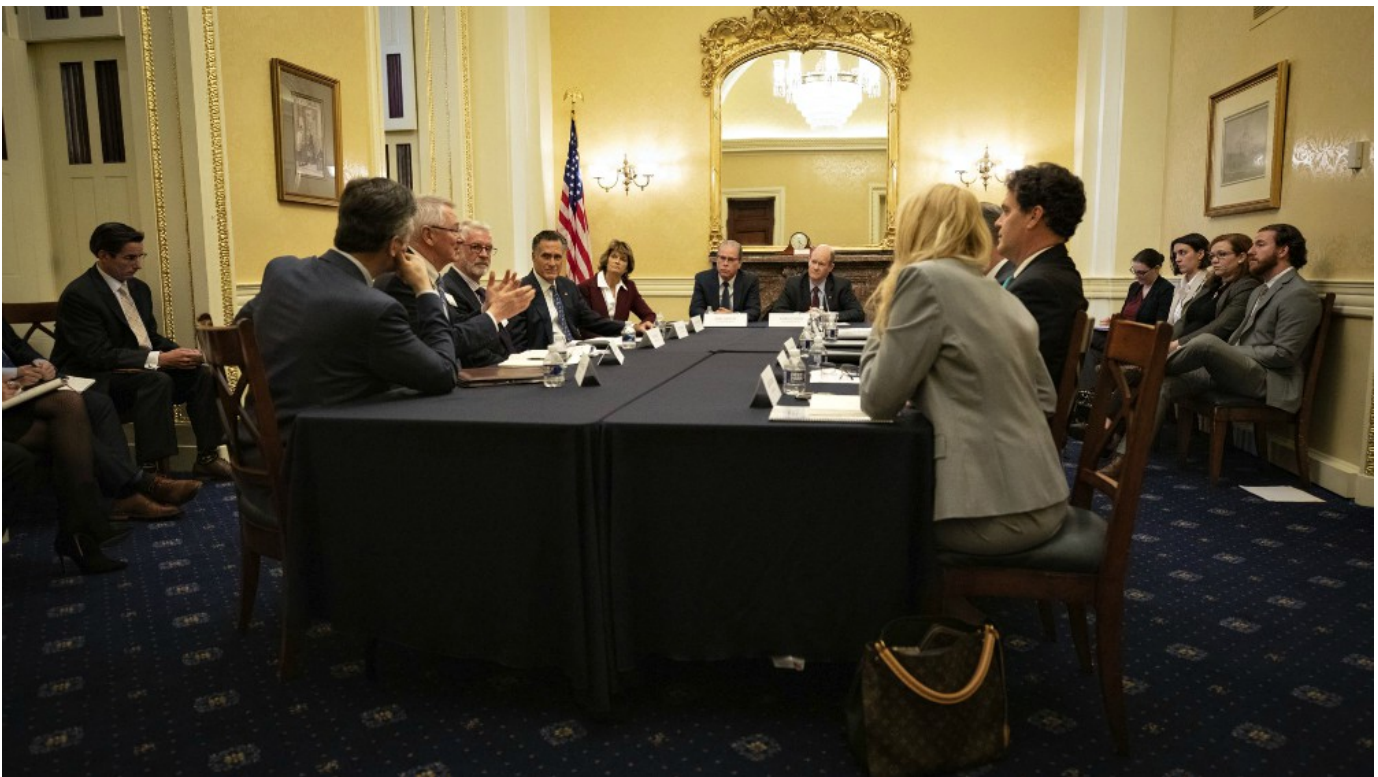
The Senate Climate Solutions Caucus meets in November 2019.

The Senate Climate Solutions Caucus formed in 2019, following the creation of a similar caucus in the House of Representatives three years earlier. The Senate version counts 14 of the 100 senators as members.