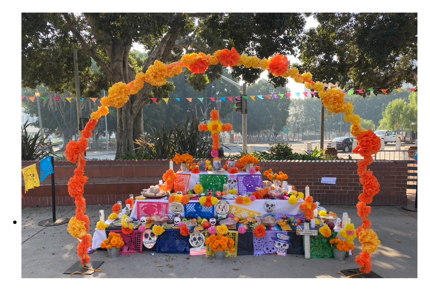
An "ofrenda" in Los Angeles Plaza in the historic center of the city, set up for Day of the Dead