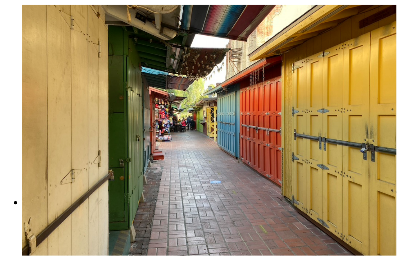
Shuttered shops on Olvera Street, Oct. 23. In the background, people sit outside a restaurant.