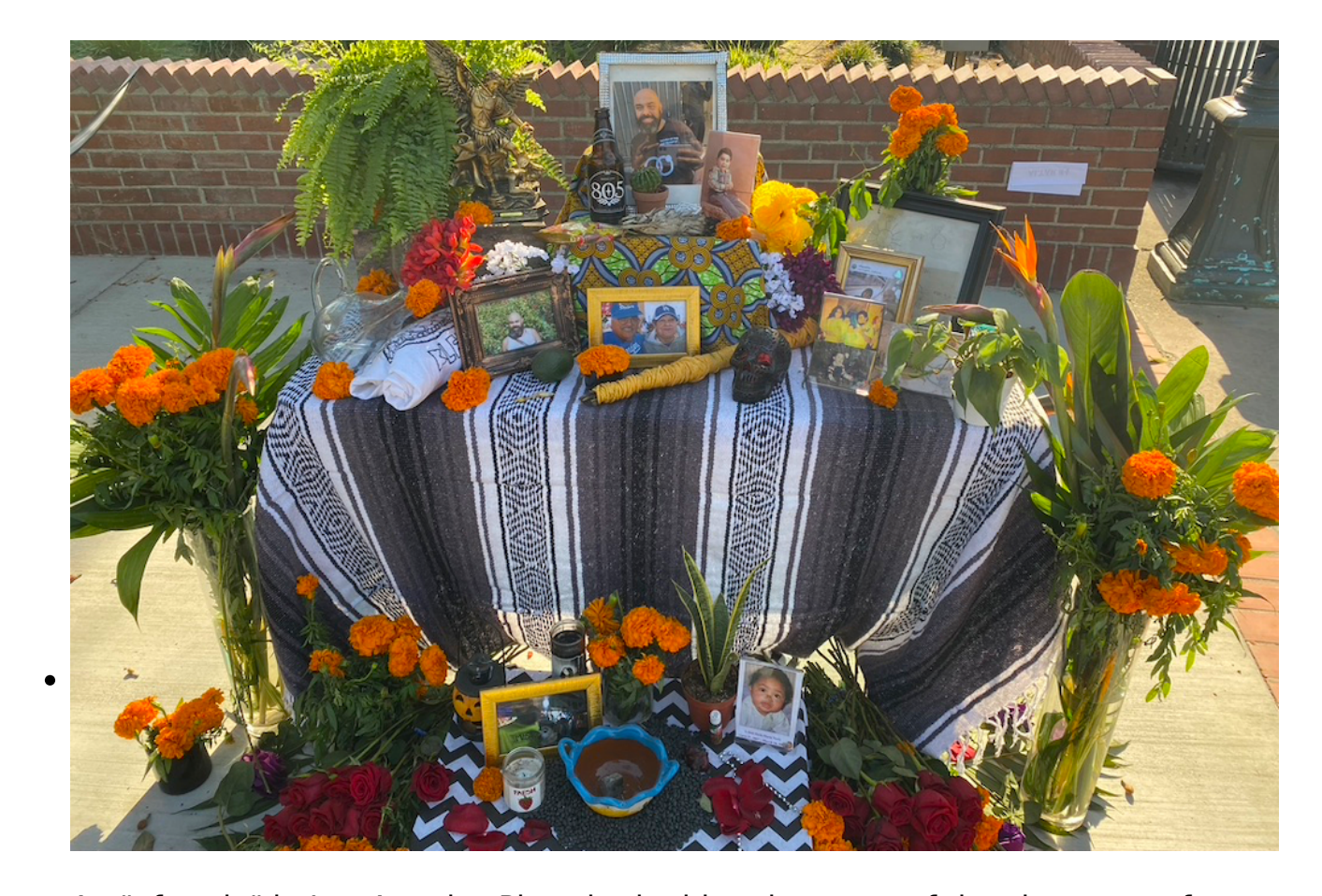
An "ofrenda" in Los Angeles Plaza in the historic center of the city, set up for Day of the Dead