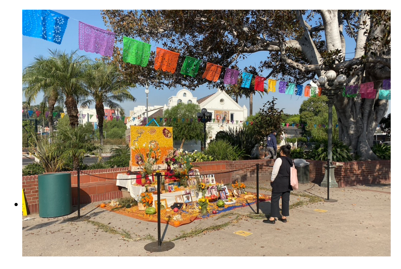
A woman looks at one of the "ofrendas" in Los Angeles Plaza Oct. 23, adjacent to Olvera Street.