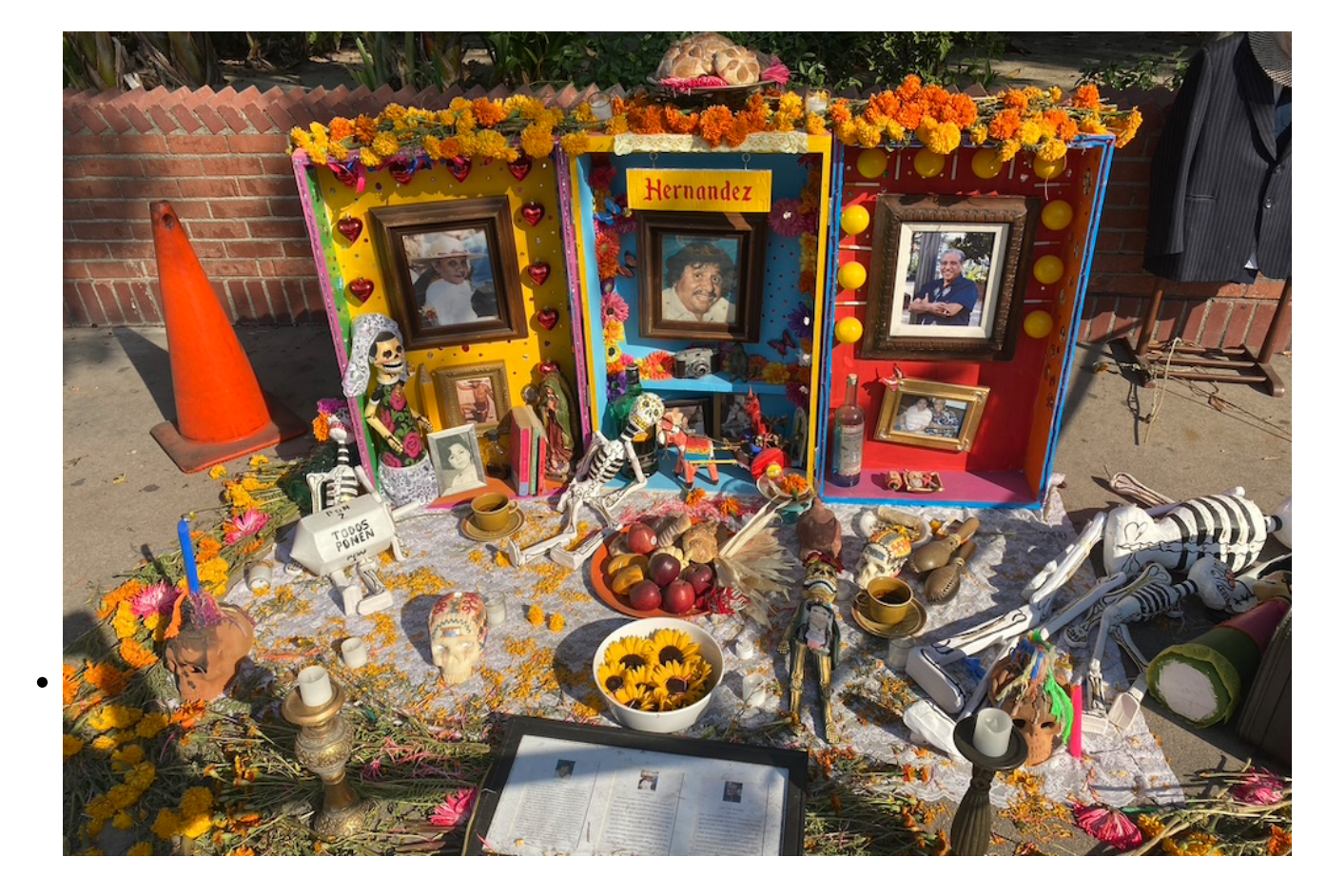
An "ofrenda" in Los Angeles Plaza in the historic center of the city, set up for Day of the Dead

[Lucy Grindon is an NCR Bertelsen intern based in Los Angeles. Her email address is <a href="mailto:lgrindon@ncronline.org">lgrindon@ncronline.org</a>.]