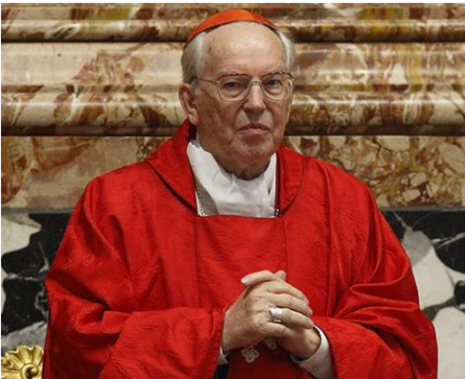
Cardinal Giovanni Battista Re, now dean of the College of Cardinals, in a 2019 photo

"Ultimately, the path of a canonical process to resolve factual issues and possibly prescribe canonical penalties was not taken," states the summary. "Instead, the decision was made to appeal to McCarrick's conscience and ecclesial spirit by indicating to him that he should maintain a lower profile and minimize travel for the good of the Church."