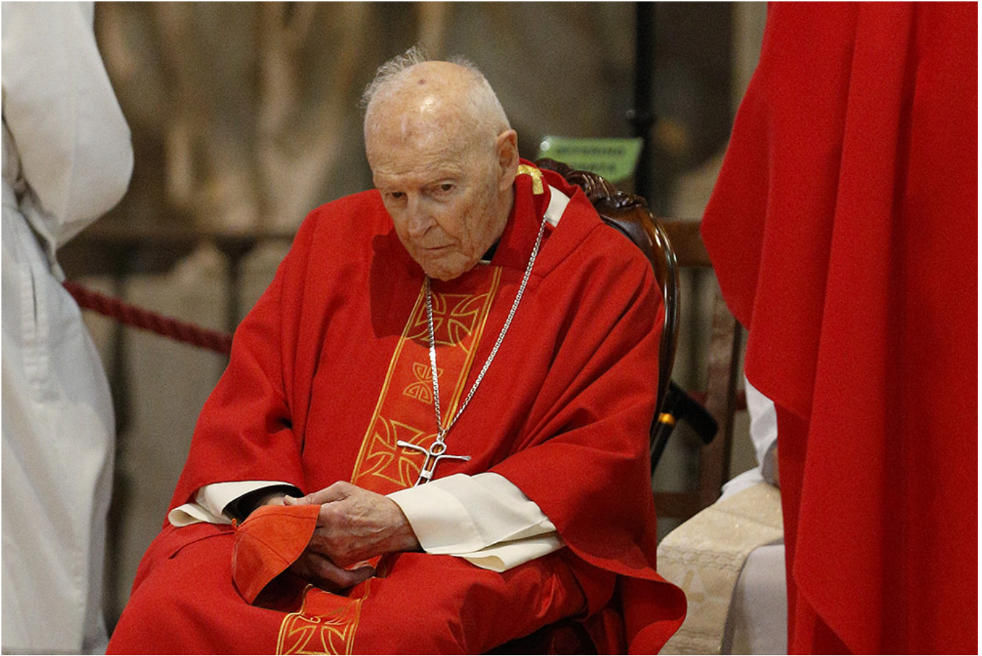
Then-Cardinal Theodore McCarrick attends a Mass April 11, 2018, in Rome.