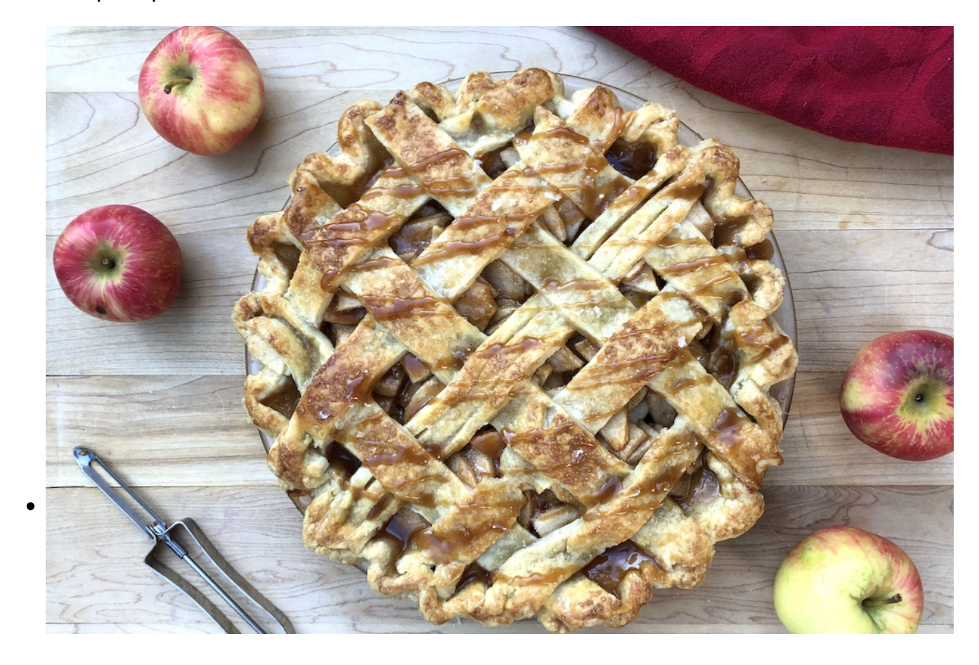
Apple pie (Renée LaReau)