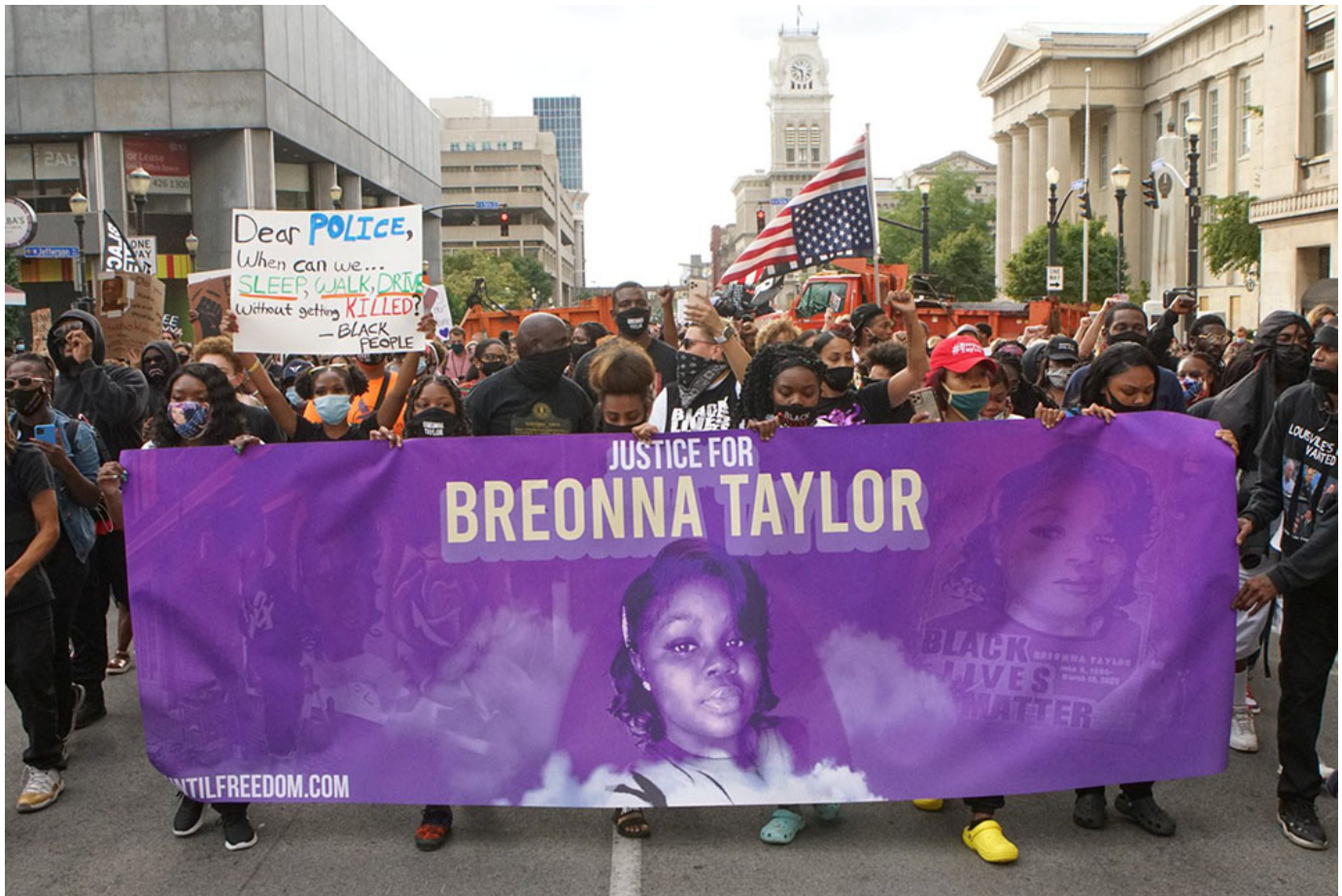
Demonstrators in Louisville, Kentucky, march for Breonna Taylor Sept. 25.