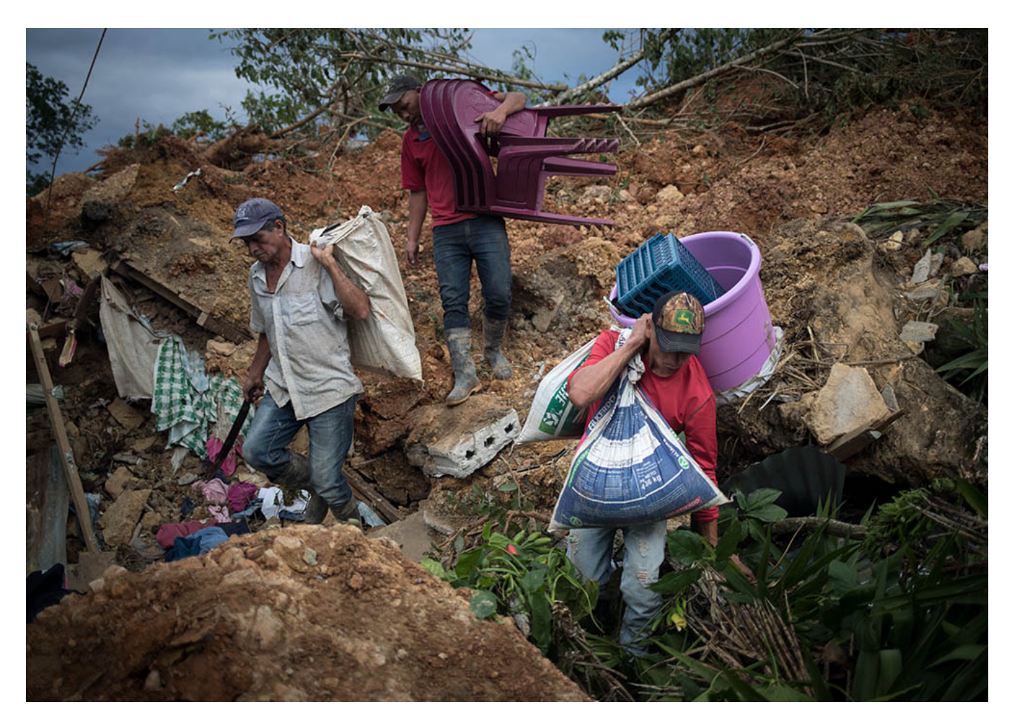
(© Sean Hawkey)

Following the very heavy rainfall that came with the hurricanes, there were thousands of landslides across the country, cutting through roads, villages and farms.