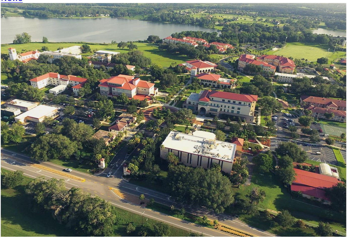
A 2017 aerial view of the main campus of St. Leo University in St. Leo, Florida