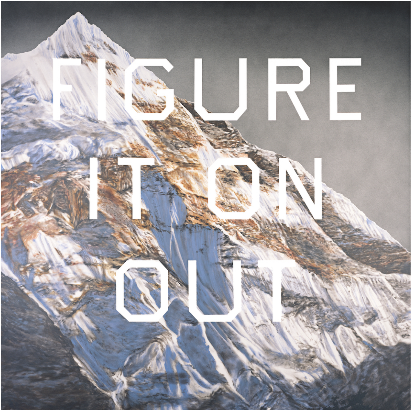
"Figure It On Out" by Ed Ruscha, acrylic on canvas, 2007, 60" x 60"

The preposition "on" in " Figure It On Out " (2007) may trip up out-of-towners, as may double (and triple) negatives, as in "I ain't telling you no lie" and "I never done nobody no harm." Ruscha's " Well Well " (1979) shows oil derricks — or wait for it, wells — on either end. They are immediately identifiable to those who live in a state where oil is such a part of the economy and mythology.