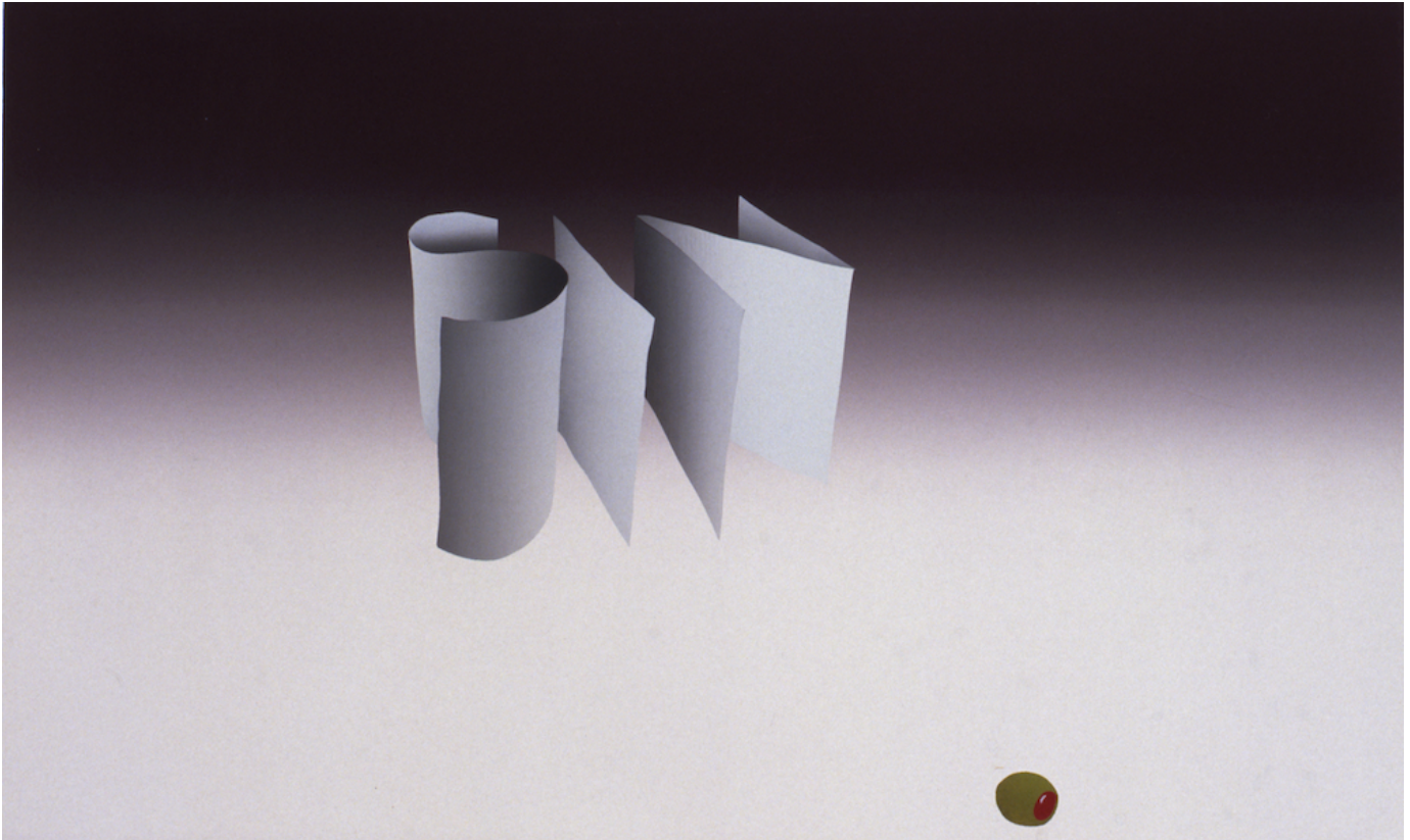
"Sin" by Ed Ruscha, screen print on paper, 1970, 19" x 26 1/2"