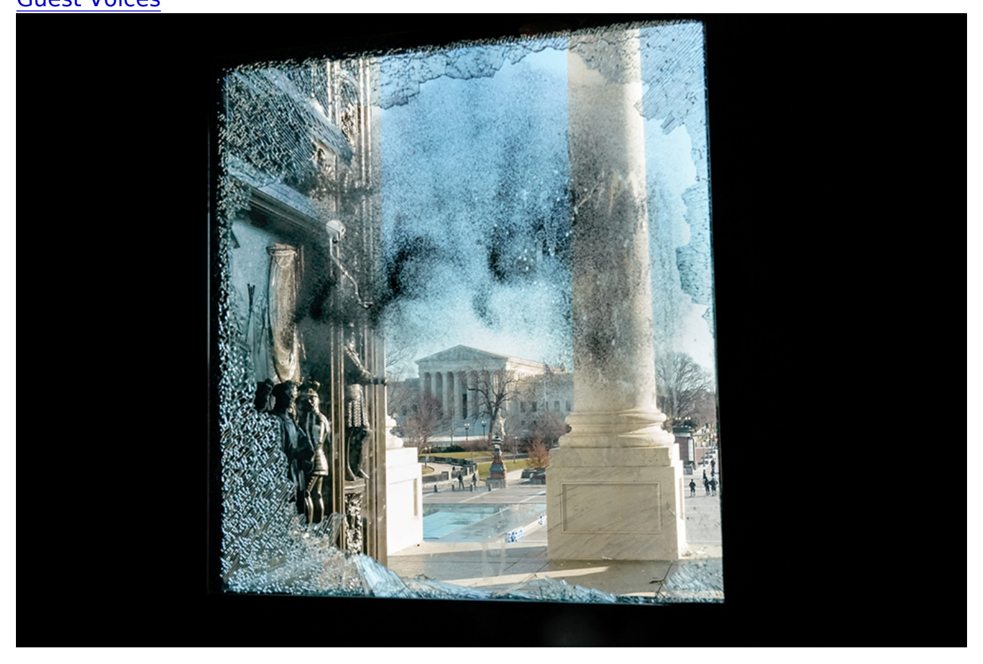
The U.S. Supreme Court is seen through a smashed glass door at the U.S. Capitol in Washington Jan. 7, one day after supporters of President Donald Trump stormed Capitol Hill.