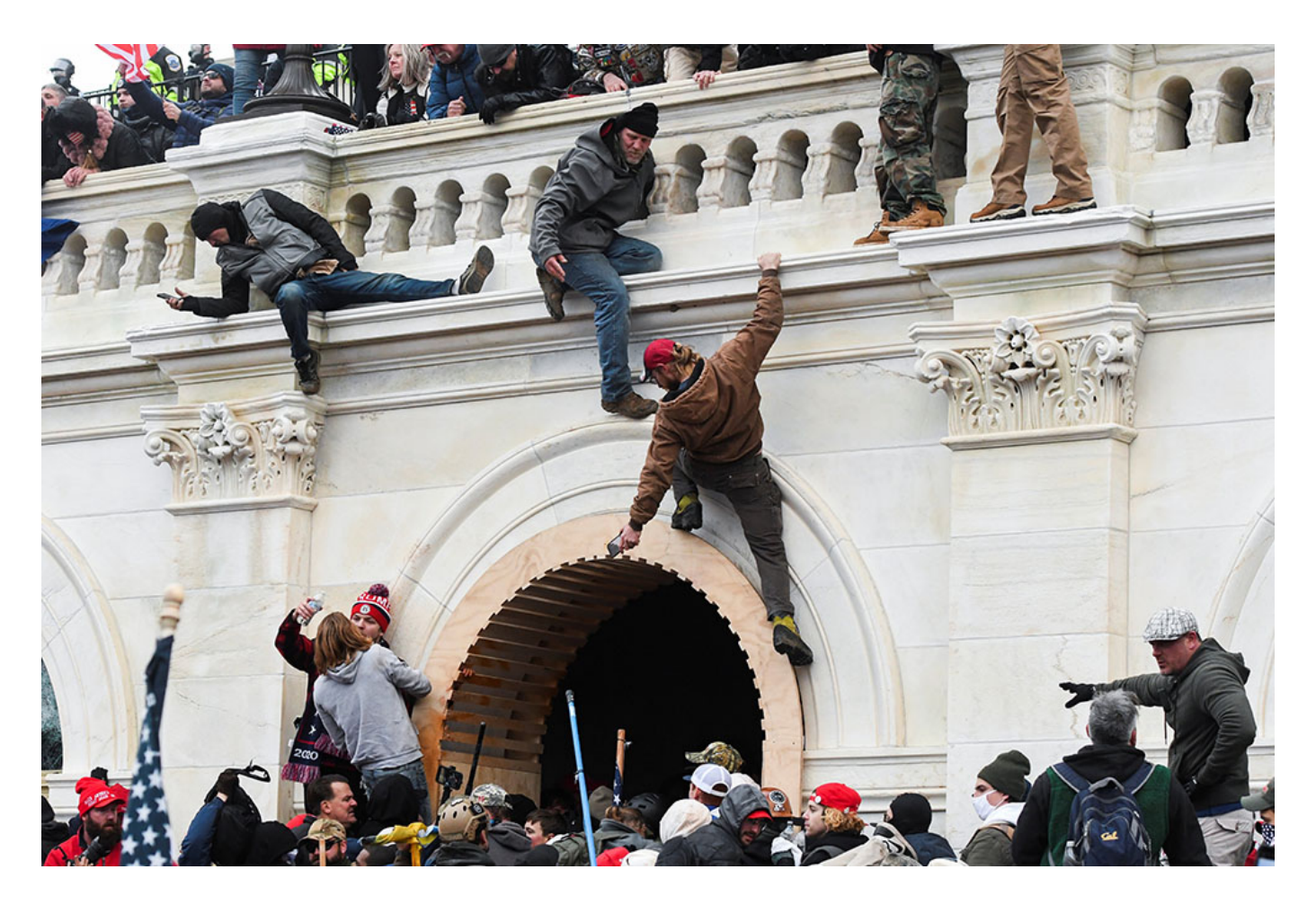
Supporters of President Donald Trump climb on walls at the U.S. Capitol in Washington Jan. 6.

What consequences will emerge from the carnage that Trump once imagined and finally created is yet to be determined. But it was consoling, for a moment, to think that in less than two weeks the unhinged, incompetent and absurdly self-indulgent would be replaced by competence and intelligence, even compassion, and, above all, regard for democratic norms that had become tattered.