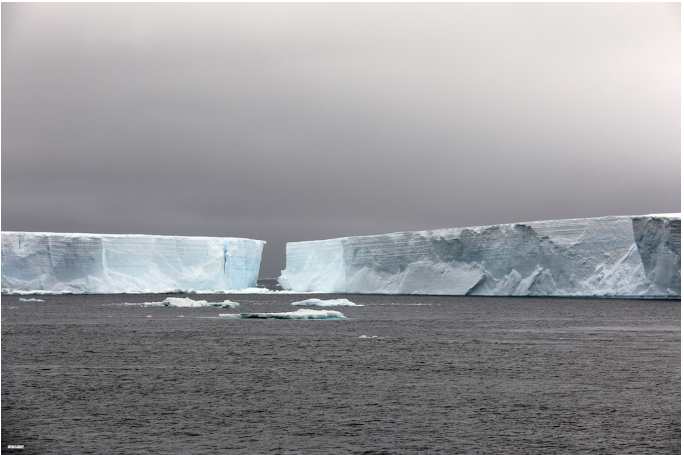
Glaciers and icebergs in Antarctica

Whether you agree or not with the original Gaia theory, it is obvious that we are becoming collectively self-aware of the bad consequences of our actions on our own life-support system. My proposal with Bruno Latour is that we could in principle add a bit of self-awareness to the Earth's self-regulation. At the very least we could sense where things are going wrong better (through satellites etc) and correct our mistakes faster. We could also use the prior Gaia to provide a template for designing a more flourishing sustainable future — including sustainable energy, material recycling, and horizontal information exchange, supporting a rapid learning process.