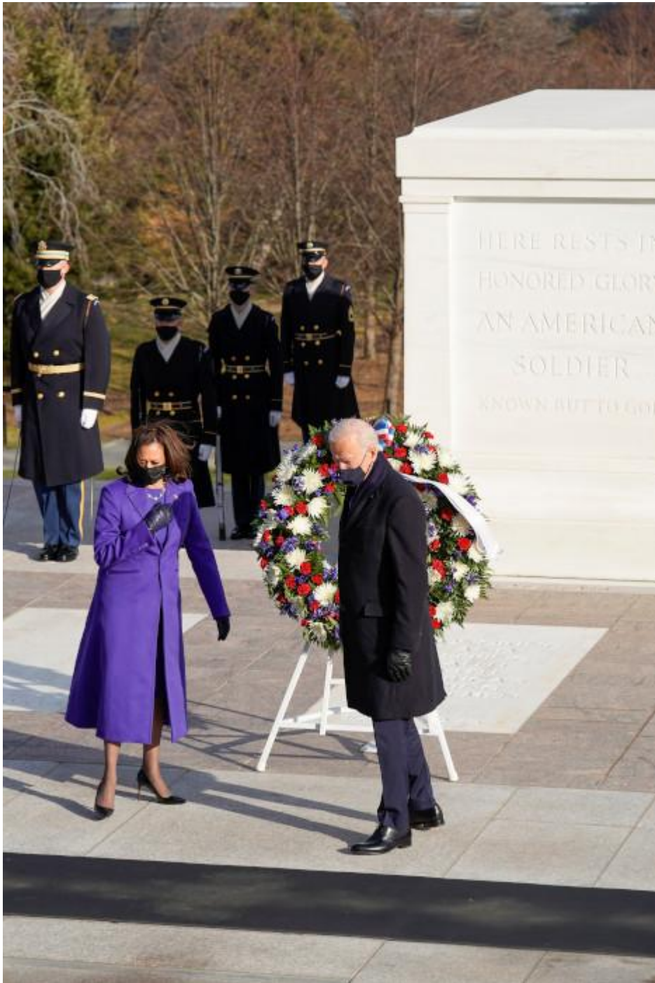
President Joe Biden and Vice President Kamala Harris participate in a wreath-laying ceremony at the Tomb of the Unknown Soldier at Arlington National Cemetery in Arlington, Va., Jan. 20, 2021.

raging fire destroying everything in its path. Every disagreement doesn't have to be a cause for total war, and we must reject the culture in which facts themselves are manipulated and even manufactured.