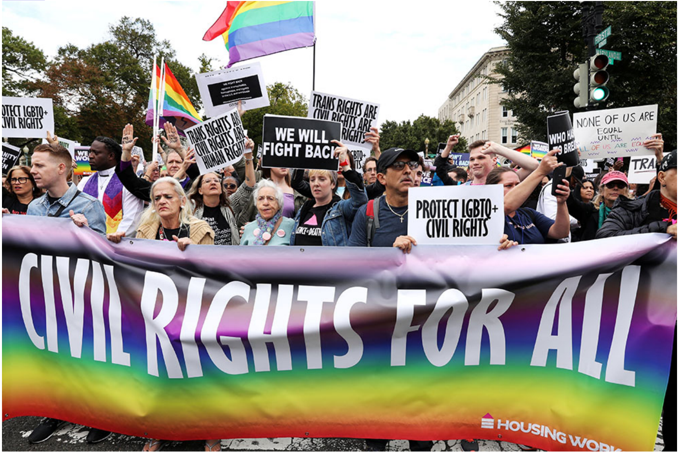
Activists demonstrate in support of LGBTQ rights outside the U.S. Supreme Court in Washington Oct. 8, 2019.