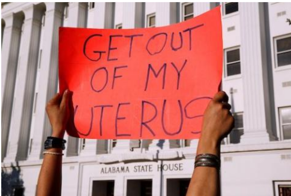
A demonstrator in front of the Alabama State House protests May 14, 2019, against an Alabama law banning nearly all abortions.

Moreover, the policies promoted by the Democratic Party are demonstrated to work to reduce abortion — as 48 years of culture war and misguided legislation from the right have not. And it is a mistake for pro-life Catholics to treat pro-choice concerns about personal privacy and bodily autonomy as irrelevant. Yes, we want a culture in which women choose life. Do we want one in which they are coerced into doing so? What kind of moral landscape would that be?