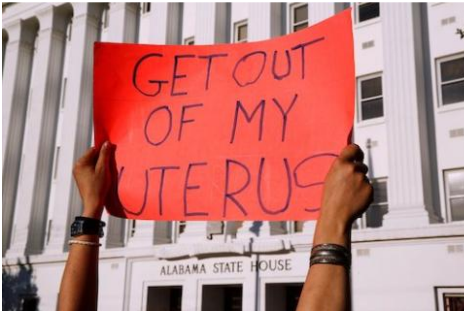
A demonstrator in front of the Alabama State House protests May 14, 2019, against an Alabama law banning nearly all abortions.

Catholics who uphold magisterial teachings on morality ought to find common cause with pro-choice advocates because of our many shared goals of eliminating poverty, fighting structural racism, working for peace and protecting the environment. Moreover, the policies promoted by the Democratic Party are demonstrated to work to reduce abortion — as 48 years of culture war and misguided legislation from the right have not. And it is a mistake for pro-life Catholics to treat pro-choice concerns about personal privacy and bodily autonomy as irrelevant. Yes, we want a culture in which women choose life. Do we want one in which they are coerced into doing so? What kind of moral landscape would that be?