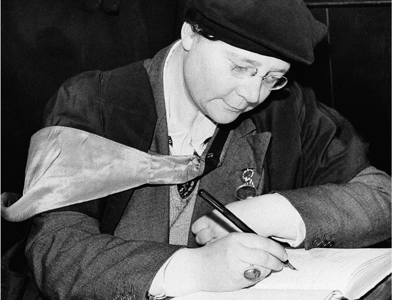
Dorothy L. Sayers signs a visitors' book Feb. 6, 1942, at St. Martin-in-the-Fields church in London, where she addressed the congregation at a lunchtime service.