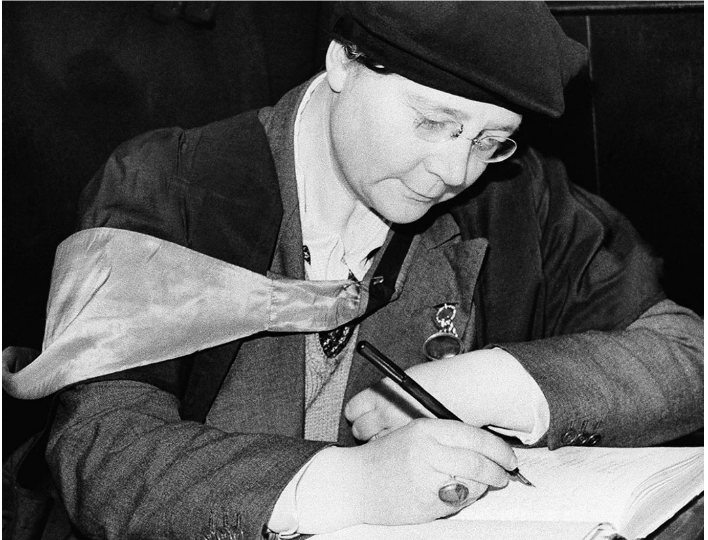
Dorothy L. Sayers signs a visitors' book Feb. 6, 1942, at St. Martin-in-the-Fields church in London, where she addressed the congregation at a lunchtime service.