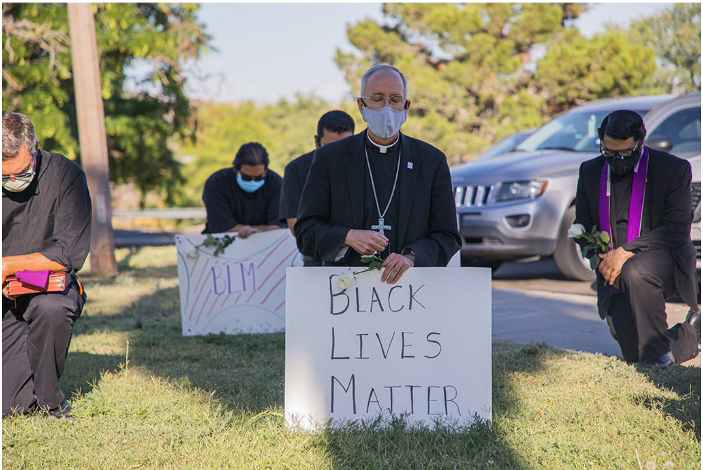
Bishop Mark Seitz of El Paso, Texas, kneels at El Paso's Memorial Park holding a "Black Lives Matter" sign June 1, 2020.

Black Catholics want to feel heard; they want a church that reflects and uplifts them toward liberation; a church that cares about their spiritual and physical lives — a church that atones.