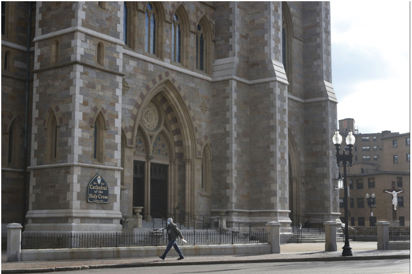
The Cathedral of the Holy Cross in Boston on Jan. 22.