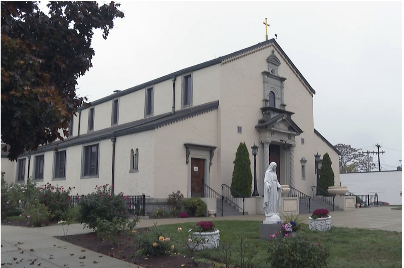
The St. Francis of Assisi School in Braintree, Massachusetts on Oct. 28, 2020.

The archdiocese, along with its parishes and schools, collected more than $26 million in paycheck money. New Orleans Archdiocesan officials didn't respond to written questions.