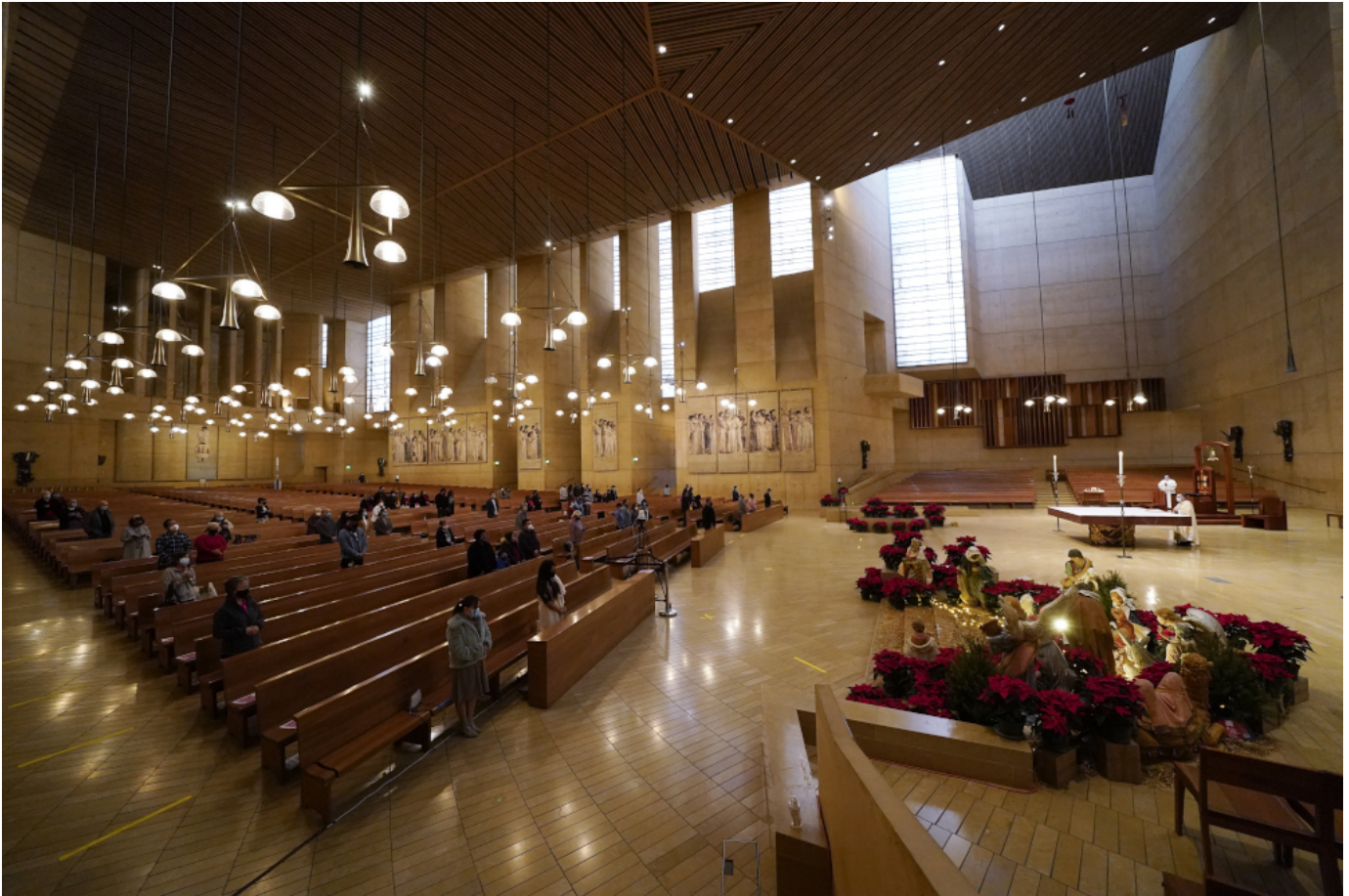
In this Dec 24, 2020, file photo, worshippers gather for Christmas Eve Mass at the Cathedral of Our Lady of the Angels in Los Angeles.

While some Catholic officials insisted their affiliates are separate and financially independent, AP found many instances of borrowing and spending among them when dioceses were faced with prior cash crunches. In Philadelphia, for example, the archdiocese received at least $18 million from three affiliates, including a seminary, to fund a compensation program for clergy sex abuse survivors, according to 2019 financial statements.