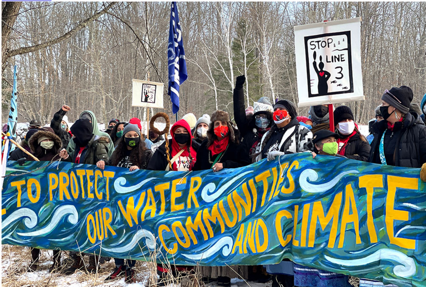
Protesters demonstrate against the Enbridge Line 3 Pipeline in northwestern Minnesota on Dec. 17, 2020.