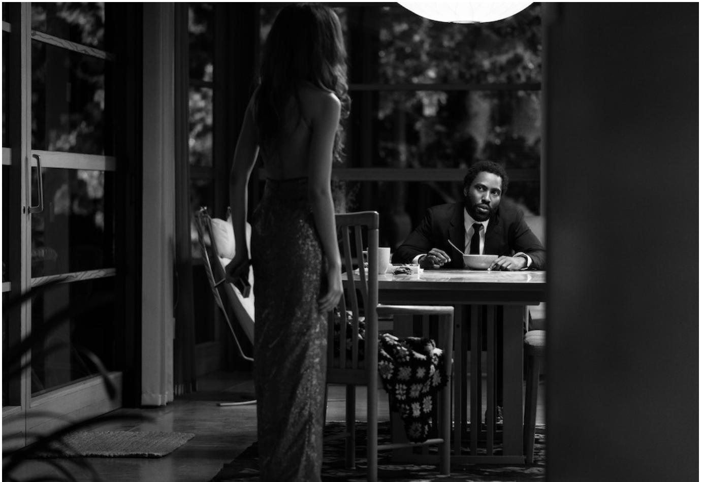
Zendaya as Marie, left, and John David Washington as Malcolm in a scene from "Malcolm & Marie"

If one were to try to mine this film for meaning or a point, it could be about watching a man's ambitions dwarf a woman. Not just the way Malcolm uses Marie's addiction as a way to further his career without so much as thanking her, but also the way Levinson's ego takes over the film. What could've been an excellent opportunity to give Zendaya a chance to expand on her growing talents as an actress turns into an outlet Levinson uses to vent about his critics.