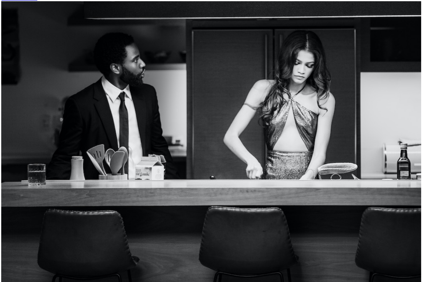
John David Washington as Malcolm, left, and Zendaya as Marie in a scene from "Malcolm & Marie"