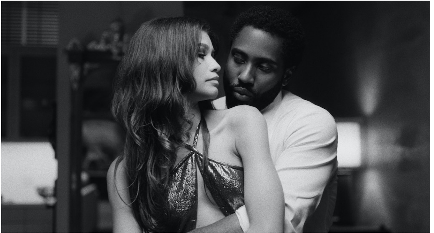
Zendaya as Marie, left, and John David Washington as Malcolm in a scene from "Malcolm & Marie"