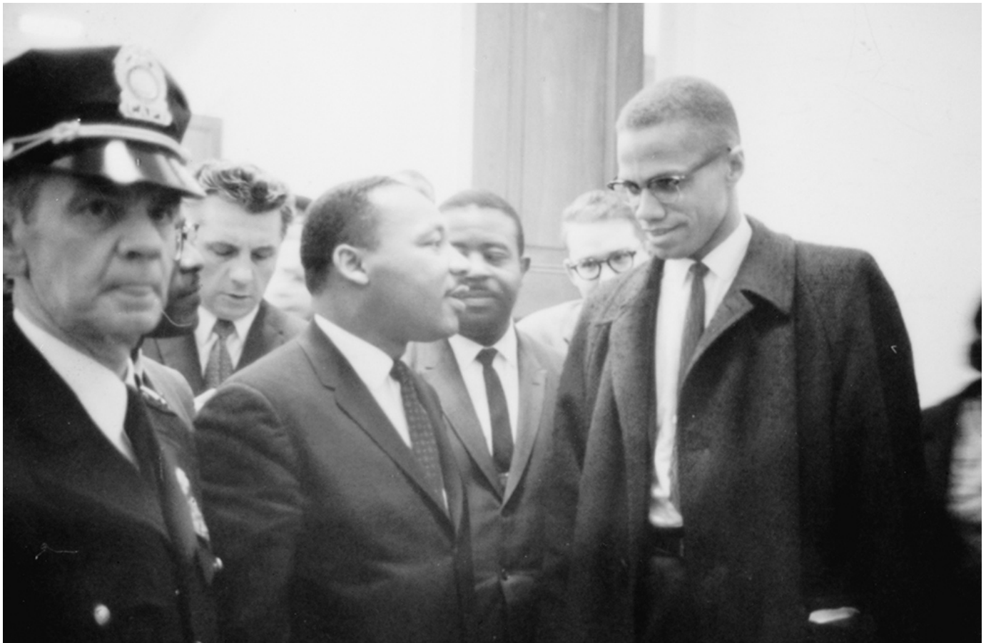
Martin Luther King Jr. speaks to Malcolm X as they wait for a press conference on Capitol Hill, Washington, D.C., March 26, 1964.

Nonetheless, the 2020 National Book Award recipient's analysis could have gone deeper.