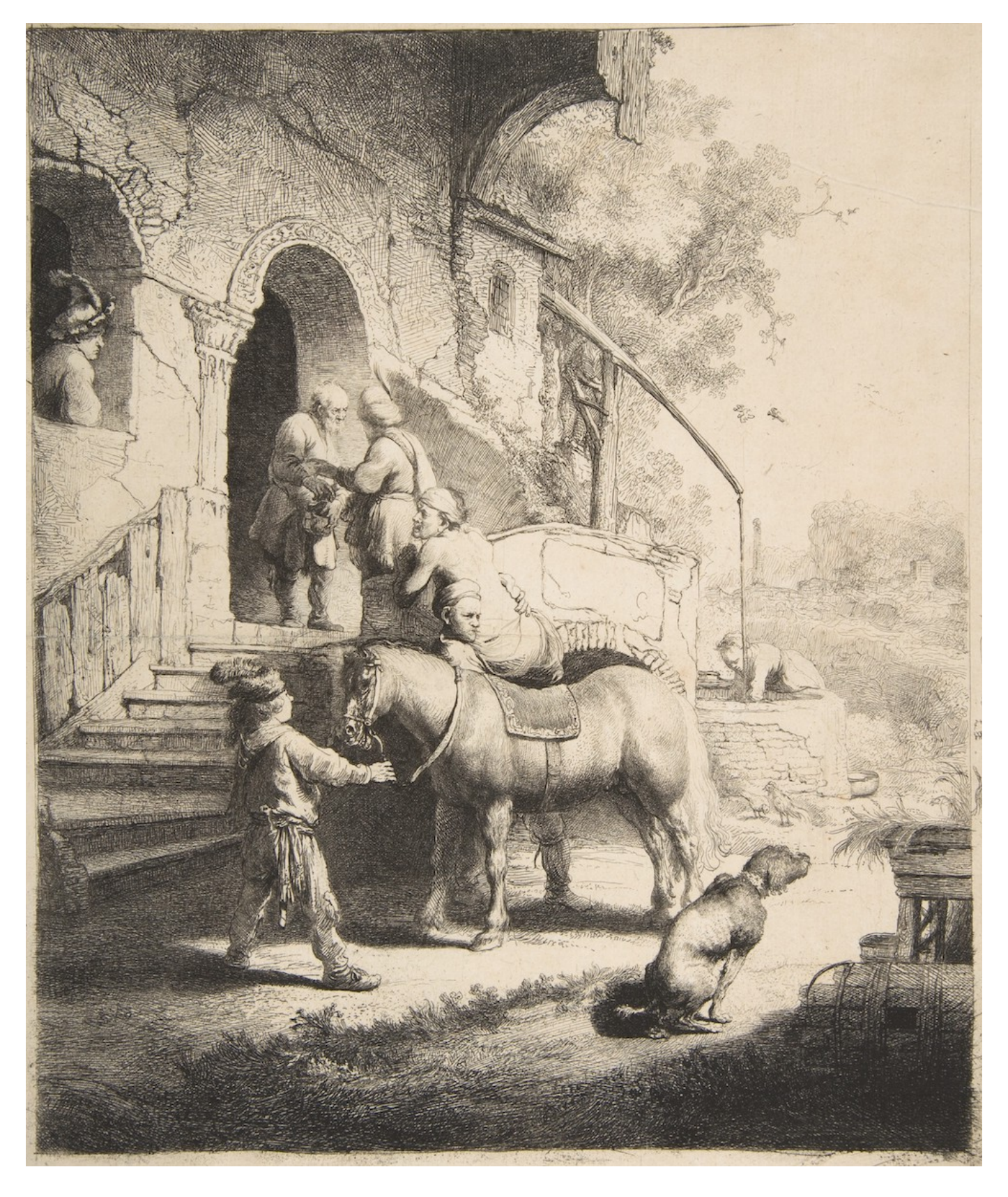
"The Good Samaritan," etching by Rembrandt van Rijn, 1633 (Metropolitan Museum of Art)