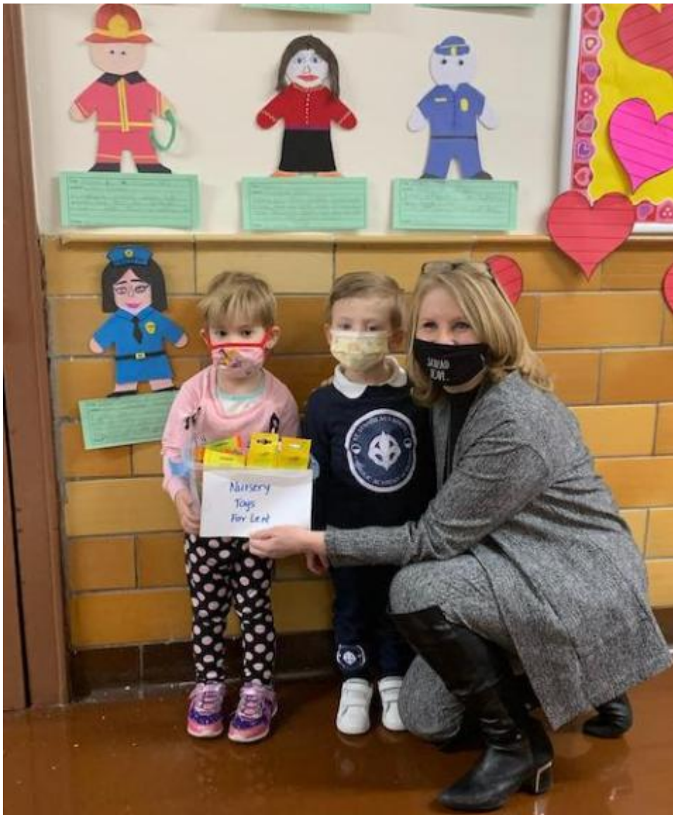
Two students stand with their teacher at St. Stanislaus Kostka Catholic Academy in Queens, New York.

She figures at least 60% of her school's children's parents work in the restaurants, nail salons and service jobs devastated by the virus and the lockdowns that followed. Many were thrown out of work while some of the Asian families packed up and left after facing pandemic related discrimination.