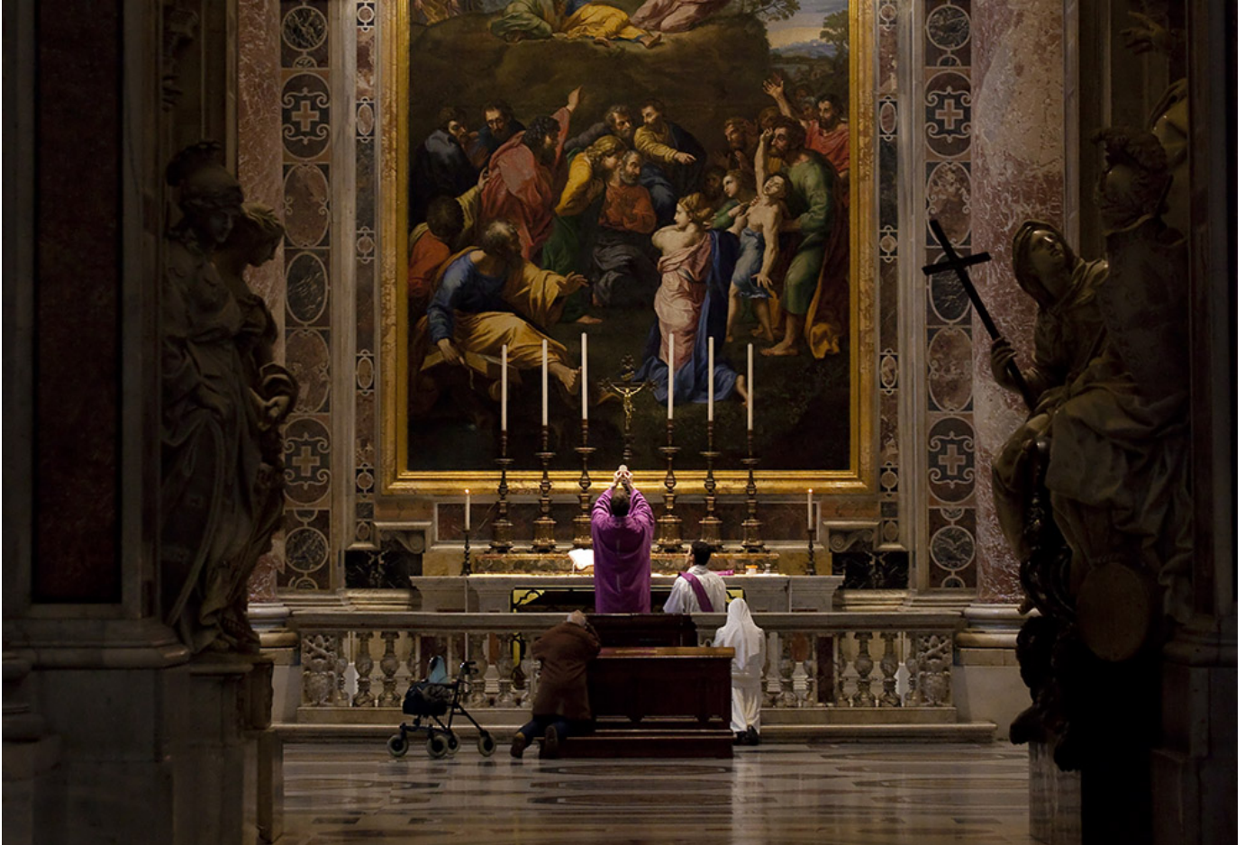
The Altar of the Transfiguration in St. Peter's Basilica at the Vatican in February 2013