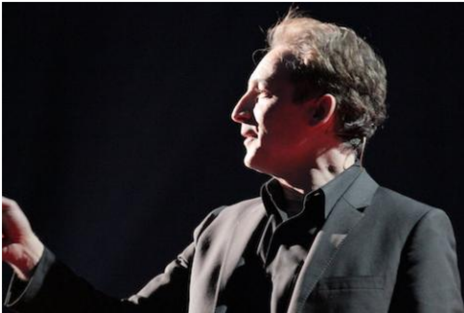
Physicist Brian Greene explaining superstring theory and the multiverse in a TED talk in Long Beach, California, Feb. 28, 2012

Greene argues that such salvific action is not free will or choice. The particles of the rock, "you" and "I" are all subject to the same inevitable and unchanging laws of physics. It is just that "you" or "I" have a more "sophisticated internal organization [that] allows for a rich spectrum of behavioral responses" not available to the rock. Curiously, Greene argues, "This notion of freedom does not require free will." He admits this use of the term "free" is a bit of a "linguistic bait and switch."