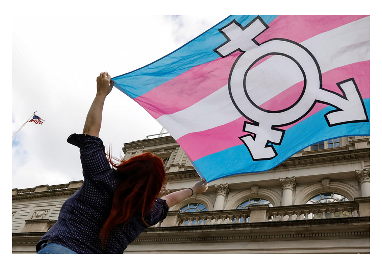
A person in New York City holds up a transgender flag Oct. 24, 2018.

The Catholic Church has its own history of discriminatory statements and actions against transgender people. In 2019, the Vatican Congregation for Catholic Education released a <u>document</u> called "Male and Female He Created Them." In it, the congregation <u>attacked the intentions of transgender people</u> and said the concept of a spectrum of gender identity would "annihilate the concept of 'nature.'