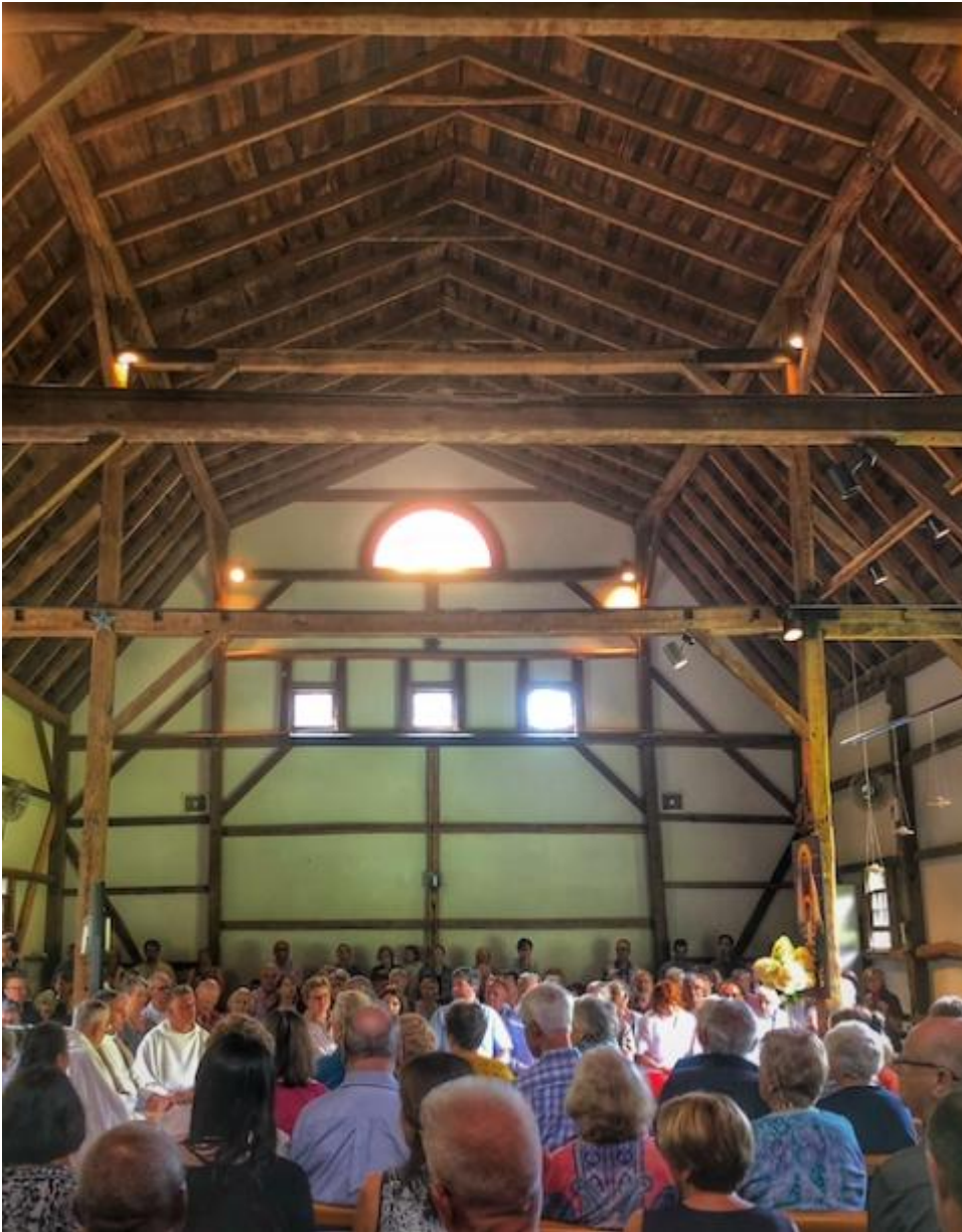
People gather in the barn at the Benedictine Grange in West Redding, Connecticut, September 2017.