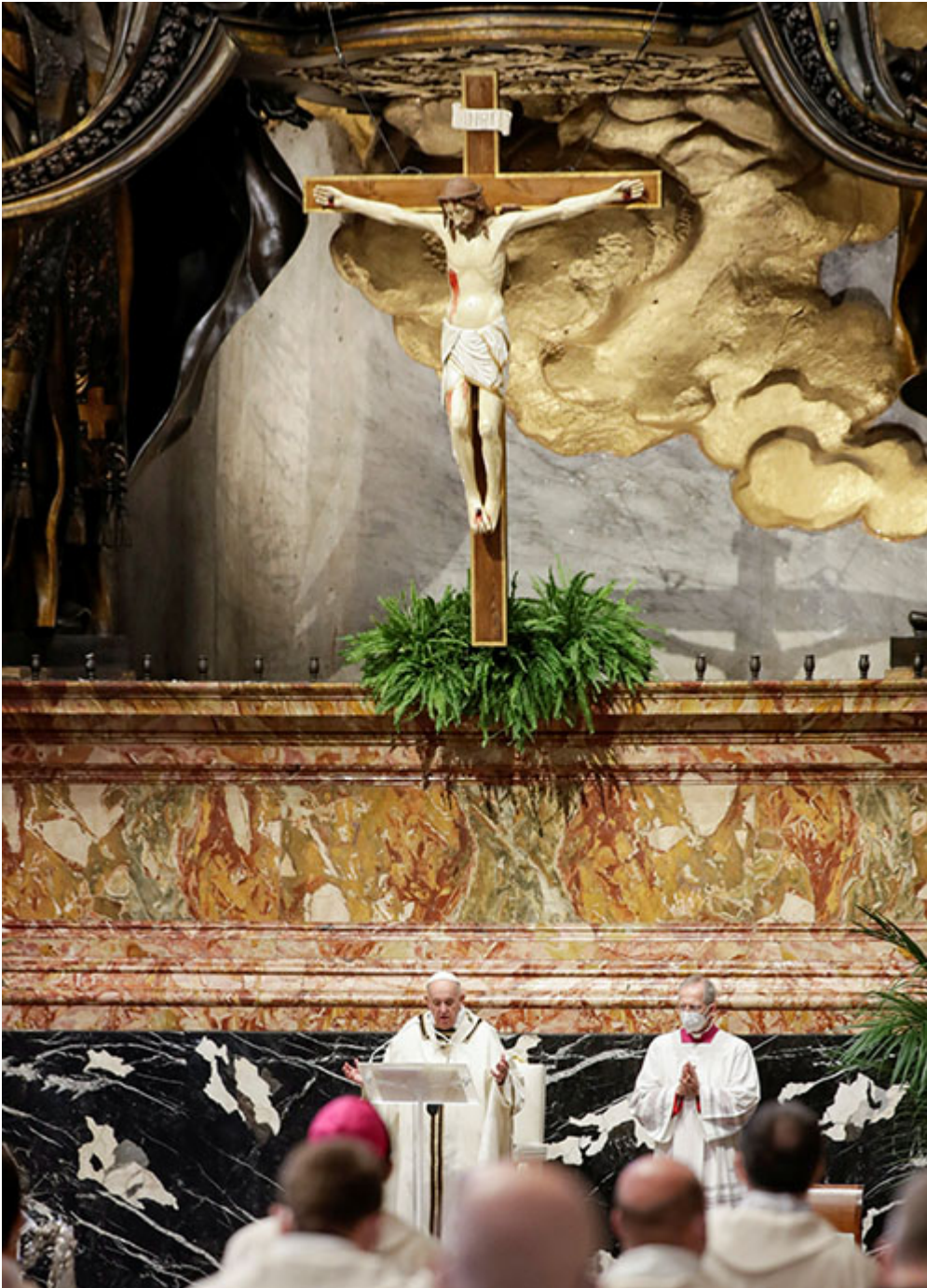
Pope Francis gives the homily as he celebrates Holy Thursday chism Mass in St. Peter's Basilica at the Vatican April 1, 2021.