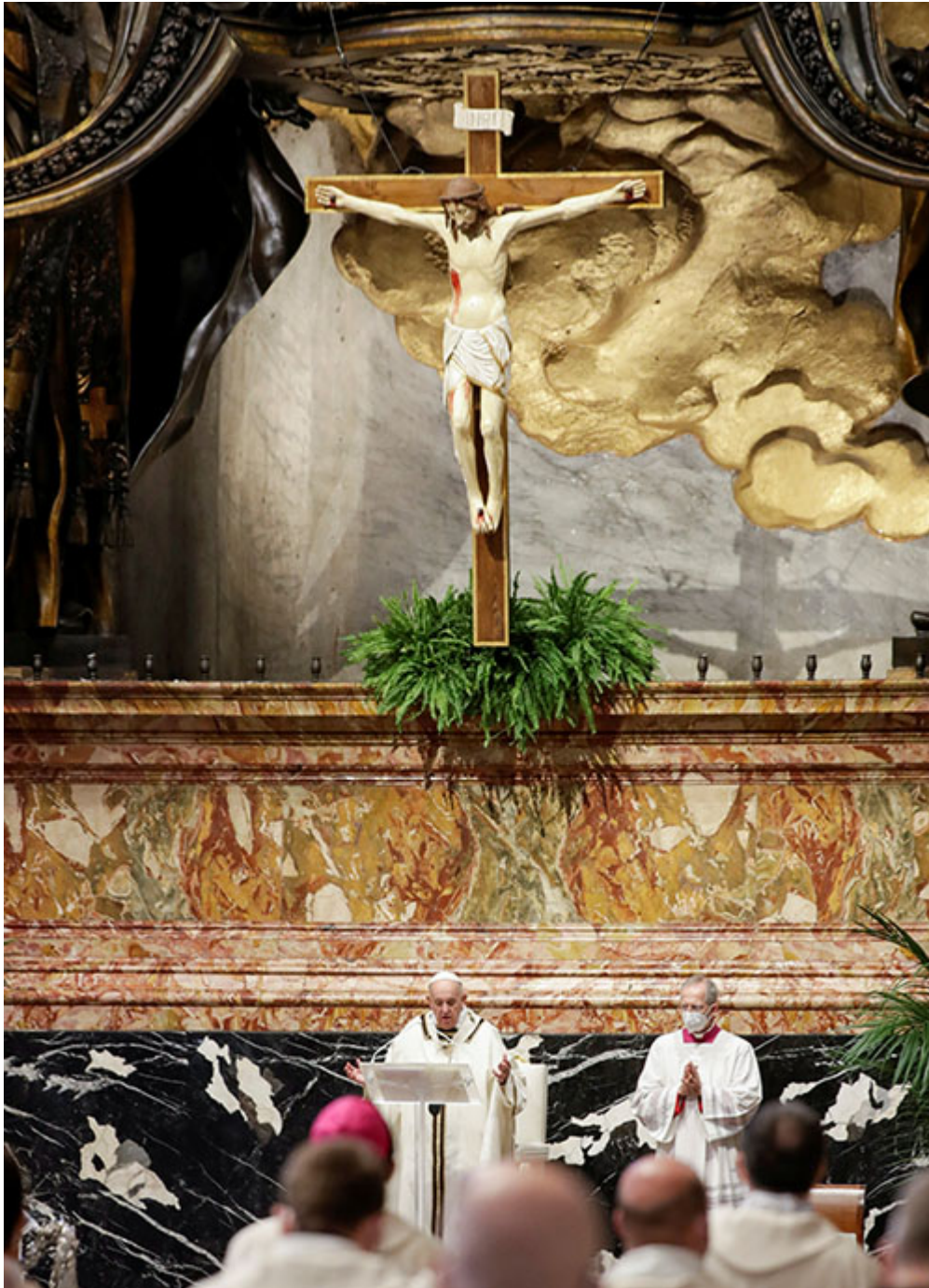
Pope Francis gives the homily as he celebrates Holy Thursday chism Mass in St. Peter's Basilica at the Vatican April 1, 2021.