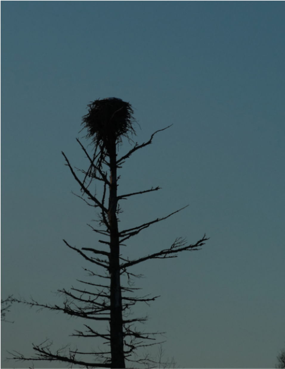
An eagle nest near the Enbridge Line 3 construction site in northern Minnesota

More than a foodstuff, the wild rice, or manoomin , symbolizes the essential cultural connection between land, subsistence gathering and the Ojibwe world view. The act of "making rice" is a tangible expression of the Ojibwe relationship with the earth, one of sustainability and commitment to ensuring resources are protected and available for future generations.