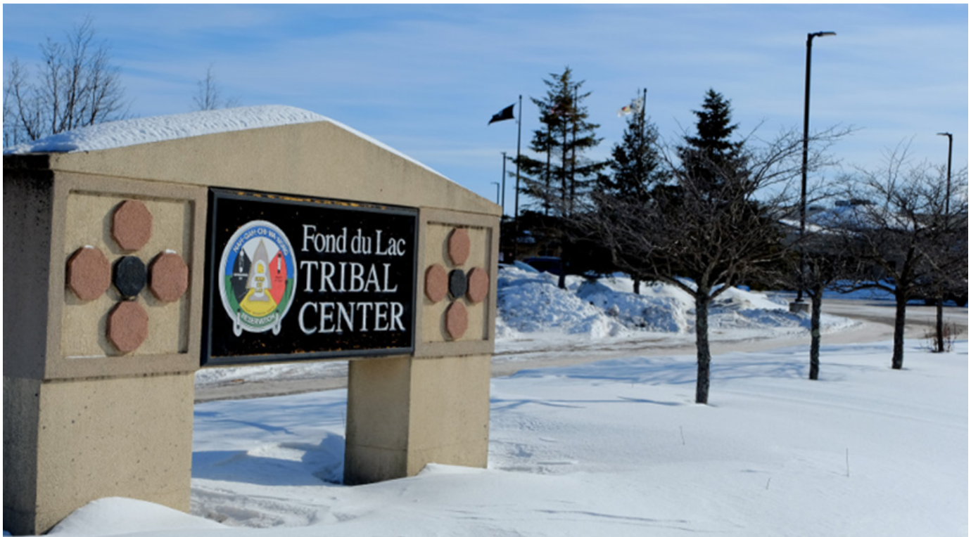
Fond du Lac tribal center in Minnesota

More recently, in 2018, in exchange for extension of Enbridge's reservation easement through 2039 for the Line 3 project, Enbridge paid the Fond du Lac Band an undisclosed sum and agreed to offer contracting, training and job opportunities for members, according to news reports. Tribal members agreed not to publicly oppose the project.