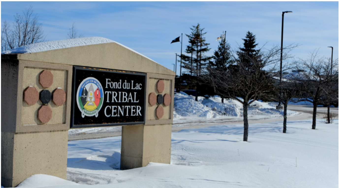
Fond du Lac tribal center in Minnesota

More recently, in 2018, in exchange for extension of Enbridge's reservation easement through 2039 for the Line 3 project, Enbridge paid the Fond du Lac Band an undisclosed sum and agreed to offer contracting, training and job opportunities for members, according to news reports. Tribal members agreed not to publicly oppose the project.