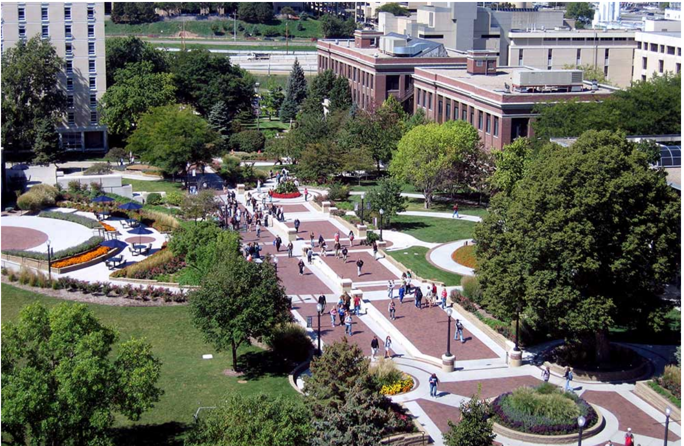
A view of Creighton University's campus in Omaha, Nebraska