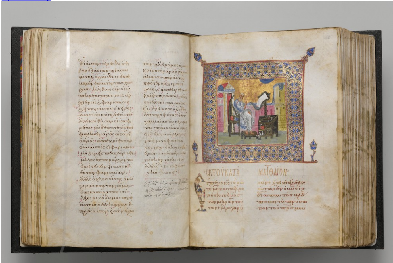
Jaharis Byzantine Lectionary, circa 1100 and made in Constantinople, open to folio 43 showing the evangelist Matthew (Metropolitan Museum of Art)

Opinion Spirituality Vatican Columns Spirituality