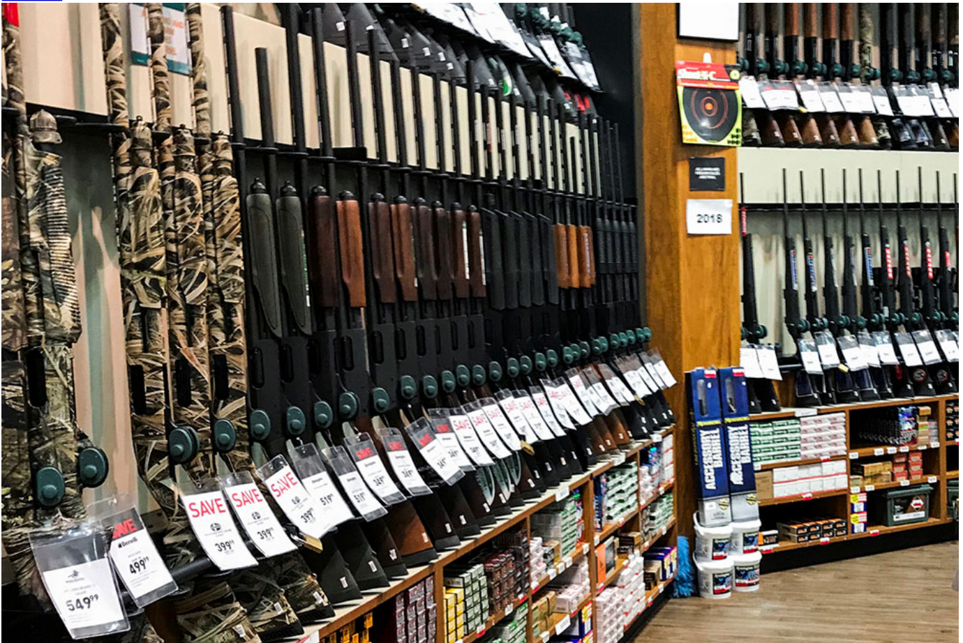
Rifles are seen inside the gun section of a sporting goods store.