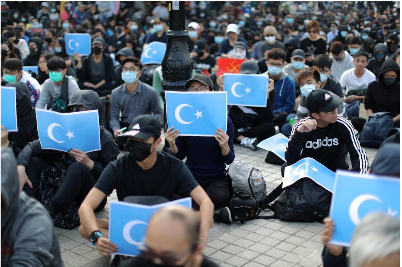
Hong Kong protesters hold East Turkestan Uighur flags at a rally in support of Xinjiang Uighurs' human rights, in Hong Kong Dec. 22, 2019.