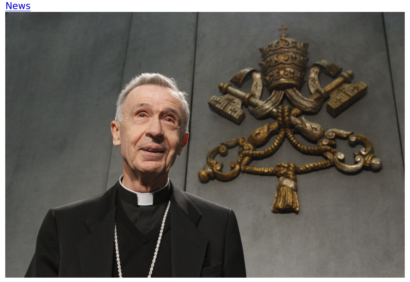
Then-Archbishop Luis Ladaria Ferrer speaks at a Vatican press conference in this Sept. 8, 2015, file photo.